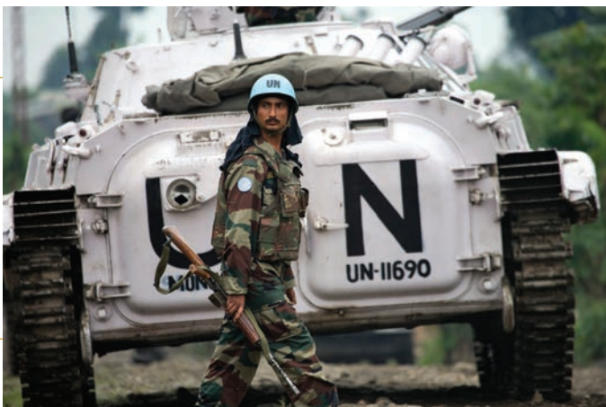
A member of the Indian battalion of the United Nations Organization Mission in the Democratic Republic of the Congo (MONUC) and the Forces Armées de la République Démocratique du Congo deploy to Kirotshe, the scene of the latest combat with the Congrès National pour la Défense du Peuple. September 2008.

Early warning mechanisms and preventive actions to improve standards of living, education, and freedom to live in peace are crucial and deserve much more attention by the United Nations and partner organizations. Robust efforts and resources should be reconverted and channelled in that direction.