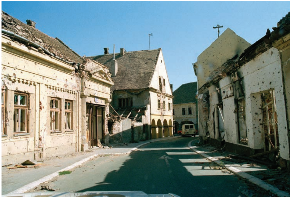
A lone vehicle turning off a deserted street in Vukovar in the Slavonia region of Croatia. September 1992.

Non-international (or intra-State) armed conflicts are protracted armed confrontations occurring between governmental armed forces and the forces of one or more armed groups, or between such groups arising within the territory of a single State. The armed confrontation must reach a minimum level of intensity and the parties involved in the conflict must show a minimum of organization. 9