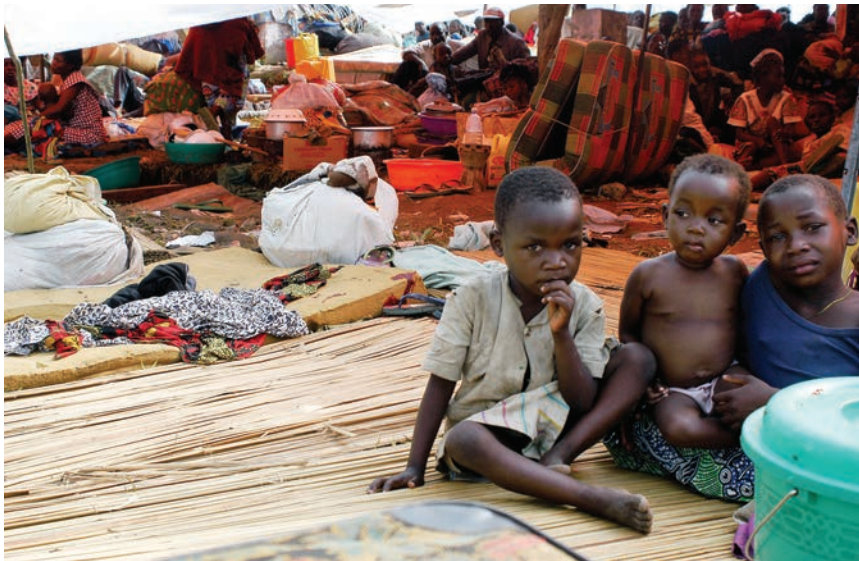
Three children, orphaned when their mother was killed in gunfire, seek shelter at UN headquarters in Bunia, DRC. May 2003.

Let us also remind ourselves that the “teams” in the arena are not playing the same game. Civilians are forced to play. The reality of civilians in conflict is very heavy in its human complexity and is not highlighted enough by simulated real-life scenarios. Civilians are people losing their children and parents, their jobs, and their properties. They are watching all their rights disappear under states of emergency lasting years rather than weeks. They are forced into poverty, physically abused, impeded from access to justice, humiliated, forced to “beg” for their lives, and are constantly searching for ways to survive in a climate of fear. Empowering these people means giving them access to their fundamental rights even in extreme states of armed conflict.