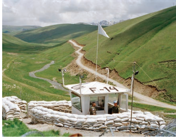
An UNPREDEP observation post on the Yugoslav border. May 1998.

Prevention can include mediation through the use of the UN Secretary-General's "good offices" with the aim to engage in dialogue with the different parties, decrease tension, and/or mediate a disagreement; the UN High Commissioner for Human Rights and his/her country or regional representatives; country visits by special rapporteurs who monitor human rights problems and help fix them by assisting countries in conforming with international standards; and dialogue facilitated by specialized International Non-governmental Organizations (INGOs). 35