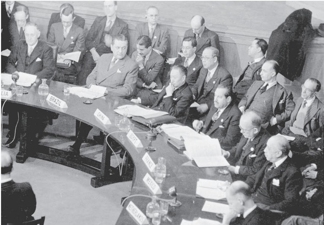
The first session of the United Nations General Assembly opened on 10 January 1946 at Central Hall in London, United Kingdom. It was during this session that the Security Council met for the first time. January 1946.

Section The United Nations (UN) was founded in 1945, immediately following the Second World War.