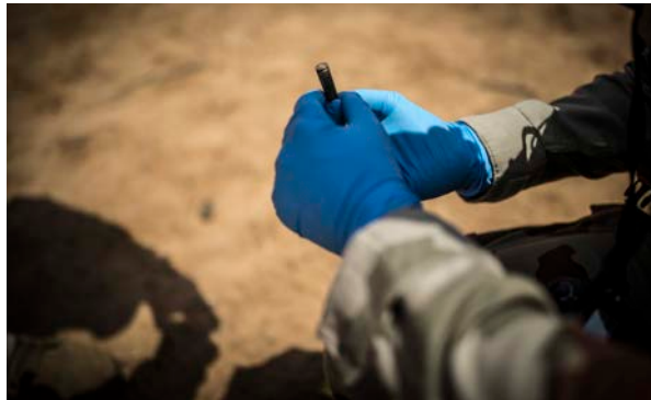
Dozens of civilians were killed during an attack on the village Sobana De, in the Mopti region of central Mali, on 9 June 2019. 12 June 2019.

“Deliberate targeting of civilian populations or other protected persons and the committing of systematic, flagrant and widespread violations of international humanitarian and human rights law in situations of armed conflict may constitute a threat to international peace and security.” 19