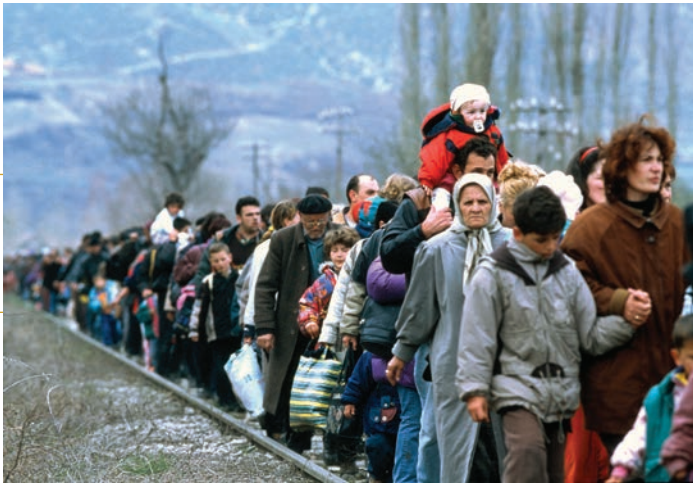
Kosovar refugees fleeing their homeland. Blace area, The former Yugoslav Republic of Macedonia. March 1999.

notion of military objective (at the expense of the civilian population). 20 Many of the brutal violations inflicted by combatants against civilians are not inflicted against opposing combatants themselves, since they, unlike civilians, benefit from modern and sophisticated military technologies aimed at minimizing military casualties.