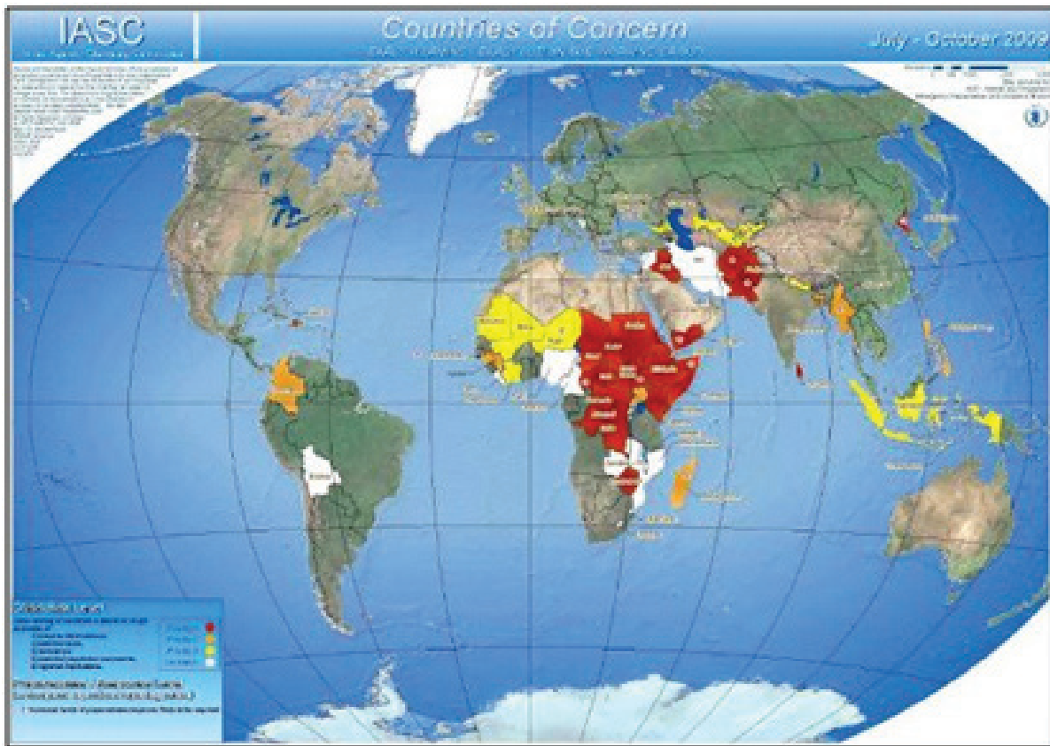
IASC Early warning map of Countries of Concern. Countries in red colour represent Priority 1. Ranking of alert is based on 1) threat to life/livelihood; 2) potential scale; 3) imminence; 4) potential population movements; and 5) regional implications.

humanitarian space, causing denial of basic human rights; concerning developments in transitional justice processes; food insecurity; increasing tensions or conflicts over pastoral land and cattle; and natural disasters and seasonal flooding. 32