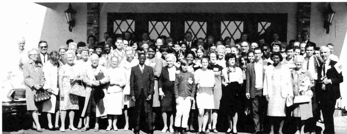
Friends who attended the N.S.A. Conference at Sarasota, Florida.

*This ocean . . . the Sacred Writings of our Faith.