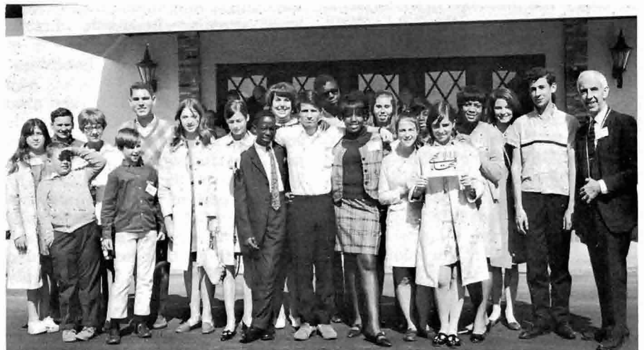
Bahá'í Youth attending N.S.A. sponsored Conference in February in Sarasota, Florida.