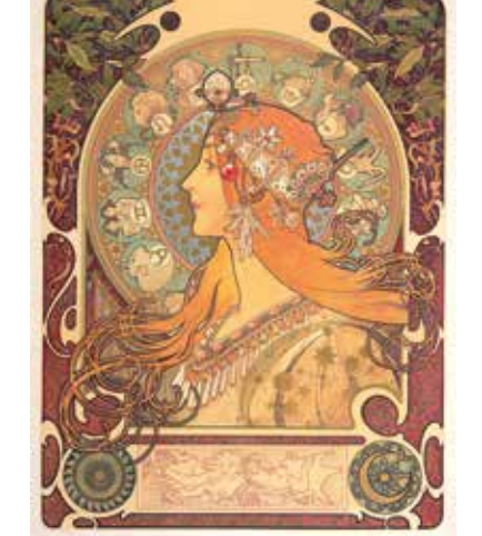
Zodiac, 1896, by Alphonse Mucha.