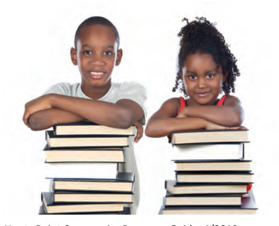
Hunts Point Community Resource Guide, 4/2012