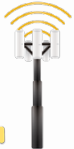
Wireless Data Connection

Knowing your total cost of operation (TCO) provides business intelligence above and beyond simply knowing asset ownership costs. Improving cost management of trucks, fleets and labor is made possible with comprehensive monitoring and reporting of operational costs which can include contract costs, maintenance, acquisition, labor (when operator access data is enabled) and more. Cost of operation can be viewed and analyzed by truck, by fleet and by location. You'll benefit with increased knowledge of actual fleet utilization and costs to help you get the most value from your material handling assets.