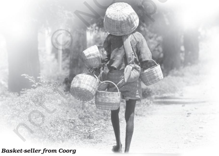
Basket-seller from Coorg