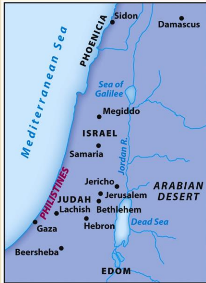
Spot Map Ancient Israel Chapter 4, Ways of the World: A Brief Global History , Second Edition and Ways of the World: A Brief Global History with Sources , Second Edition Copyright © 2013 by Bedford/St. Martin's Page 134 (page 182, With Sources)