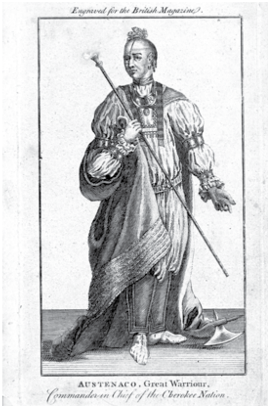
Figure 2: This image of Ostenaco is attributed to Joshua Reynolds, the London artist for whom Ostenaco sat while in England in 1762.

formed long-lasting bonds, Cherokee commanders made a strong commitment to recruit more warriors, and the Cherokees began mentoring select Virginians in their methods of warfare. All of these outcomes of the allied expedition contributed directly to the eventual English victory over the French, especially in the southern theater of the war.