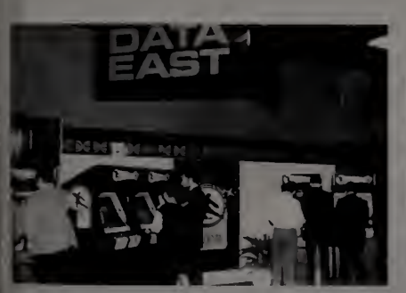
The popular "Karate Champ" was among the big attractions at the Data East exhibit.