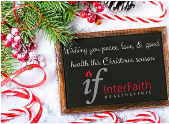
InterFaith's 2018 holiday card (an alternate version that states "holiday season" is available upon request)

The holidays are a time for us to remember friends, colleagues, and loved ones and to share the blessings of the holiday season. We invite you to share our message of health and hope by sending holiday greeting cards to those on your gift list this year, with all the proceeds underwriting direct patient care for the underserved in our community.