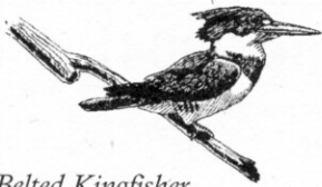
Belted Kingfisher