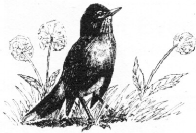
American Robin