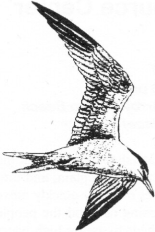
Least Tern

Everyone is welcome! These trips are fun for both beginning and expert bird lovers. Binoculars are useful for enjoyment of birds, but if you don't have a pair please call the trip leader and we'll lend you a spare. Trips are free unless noted.