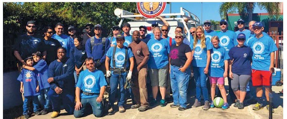
Local 569 members and supporters built a new house for a wounded veteran and fixed up several homes for families in need.

The Marin General Hospital construction project is scheduled to start this year as well as the Gra-