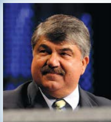
Richard L. Trumka, president of the AFL-CIO