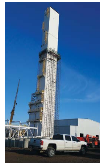
Construction gets underway on Air Separation Plant distillation column at Cristal Global jobsite, where Local 673 members are working.

L.U. 673 (catv,i,rts,spa,t&u), PAINESVILLE, OH—Last year it was announced that Cristal Global, the largest manufacturing facility in Ashtabula County, planned to build a $64 million Air Separation Plant. This plant would provide the company with the ability to manufacture its own oxygen, nitrogen and argon for its processing needs. What you see in the photo (at top, right) is the cold box, which acts as a giant distiller to separate these gases.