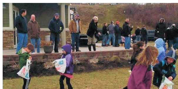
Local 41 members and their families at 2015 Easter Egg Hunt.