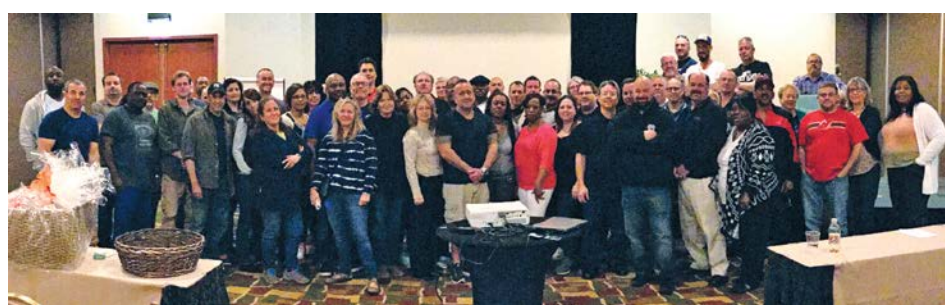
Participants gather for three-day ACCLS training seminar in Atlantic City, NJ.