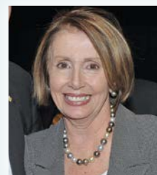
Rep. Nancy Pelosi of Calif., House minority leader

best in his retirement and thank him for his tireless efforts on behalf of the hardworking men and women of the IBEW.