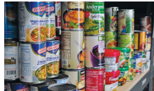
Cranbury, N.J., Local 94's young worker committee raised $6,000 in non-perishable items for an area food bank.

This spring, the committee sponsored a donation drive for the Rise Food Pantry, which shares the same street as Local 94's hall in central