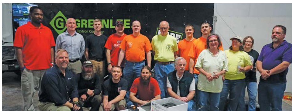
Local 159 members attend the first class held at the local's new Training Center, for a conduit bending and Greenlee tool demo session.

At press time we are preparing to go to the Coun-