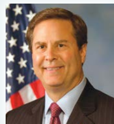
Rep. Donald Norcross of N.J., and member of Folsom, N.J., Local 351

He believed strongly in innovation and trying new, cutting edge ideas and technology. He often said, "Making mistakes is good. It's better to try something and fail, than not try at all—because if you're not failing once in a while, it means you're not doing anything new."