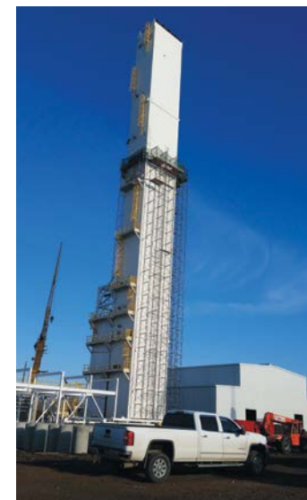
Construction gets underway on Air Separation Plant distillation column at Cristal Global jobsite, where Local 673 members are working.

L.U. 673 (catv,i,rts,spa,t&u), PAINESVILLE, OH—Last year it was announced that Cristal Global, the largest manufacturing facility in Ashtabula County, planned to build a $64 million Air Separation Plant. This plant would provide the company with the ability to manufacture its own oxygen, nitrogen and argon for its processing needs. What you see in the photo (at top, right) is the cold box, which acts as a giant distiller to separate these gases.