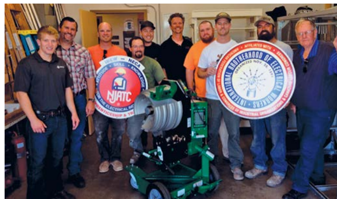
At a Local 639 training session conducted by Greenlee industrial and electrical tool company.