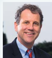
Sen. Sherrod Brown of Ohio

insistent vision guided the IBEW into the 21st century, and he retires with a towering legacy of leadership on behalf of all America's hard working men and women.