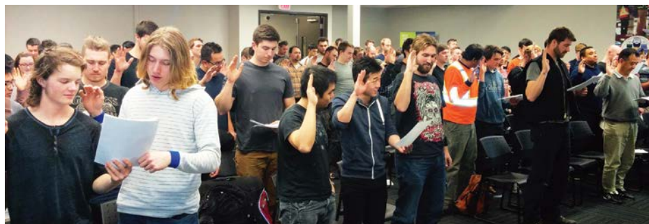
Local 213 swears in new journeymen and apprentices.