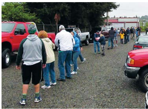
Volunteers form a human chain to deliver donated peanut butter for distribution in Pierce County, Wash.