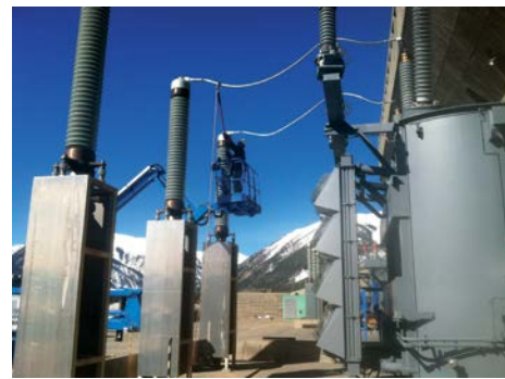
Local 1759 Bro. Nathan Lindgren, an electrician for USBR Mt. Elbert Power Plant, removes grounds from Unit 2 main transformer following maintenance inspection.