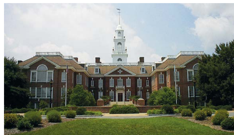
Democratic lawmakers in Delaware’s state Senate voted down a recent right-to-work bill.

The Democratic majority introduced a right-to-work bill of their own, just to vote it down.