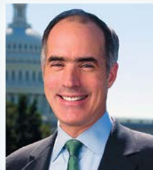
Sen. Bob Casey of Pa.