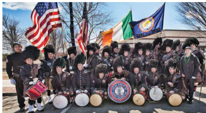
Local 25 Pipe & Drum band assembles for St. Patrick’s Day parade.

purpose of promoting Local 25 and the IBEW. Our pipers and drummers and Honor Guard dress in traditional Scottish military uniform with a feather bonnet.