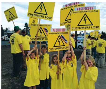
Local 125 members conduct informational picketing.