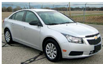
The IBEW installed a massive solar array to help power GM's Chevy Cruze factory in Lordstown, Ohio.

In Lordstown, Ohio, General Motors has assembled more than 15 million cars over nearly 50 years. Now, IBEW members have upgraded the company's manufacturing facility with two massive renewable energy projects, just the latest in GM's growing commitment to renewables.