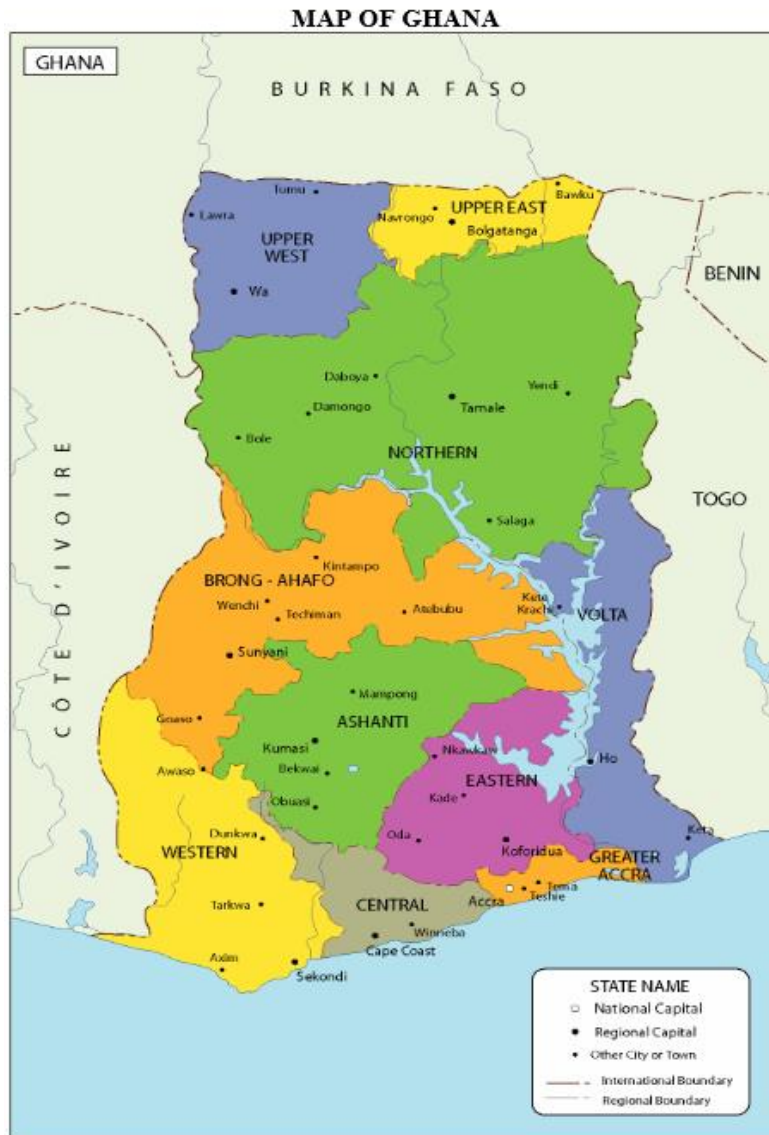
Image: 1.1 Map of Ghana (African Development Fund African Development Fund)