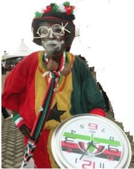
Image 1:2 Bishop Bob Okala of Ghana Concert Party 47