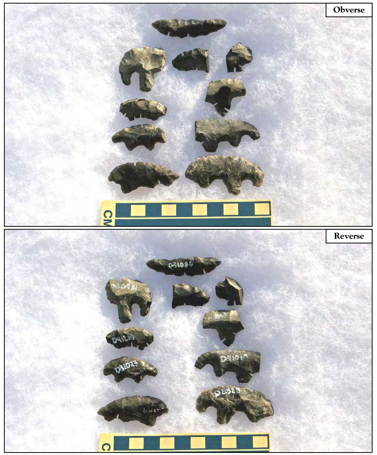
Figure 5: Eccentric crescents Bottom row, left to right, bottom to top: L10874, D21528, D31025, D41010, D41219, D30931, DRL6GF7, DRL6GF11.