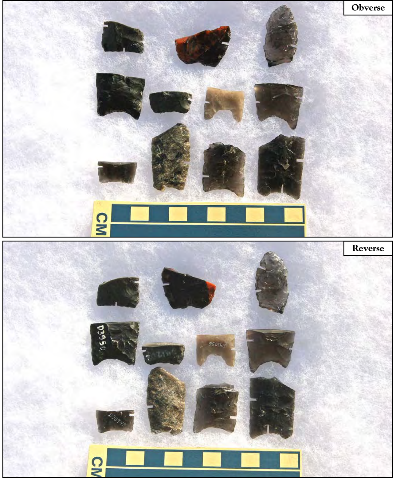
Figure 3: Concave Base points. Bottom row, left to right, bottom to top: D30943, DRL6GF1, D41199, DRL6GF2, D30950, D41262, D41036, D41179, D41272, D41101, D411100.