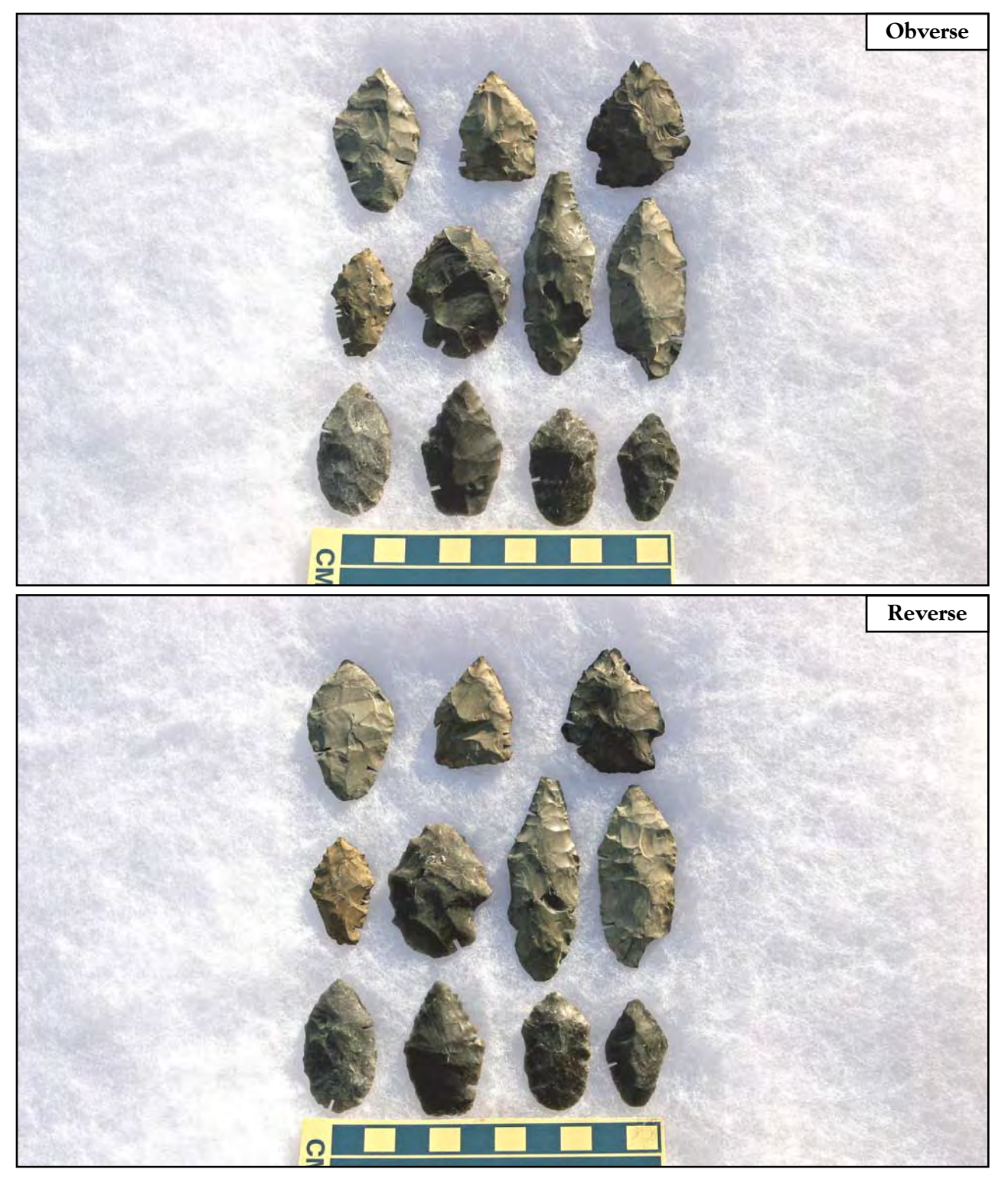
Figure 4: Great Basin stemmed points. Bottom row, left to right: D31069, D1150, D31063, D31069, DRL6GF4, DRL6GF10, D1552, D41047, D1019. Tulare Lake Basin widestem points: DRL6GF8, DRL6GF9.