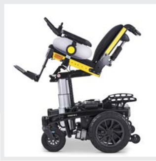
200 mm seat lift, tilt-in-space