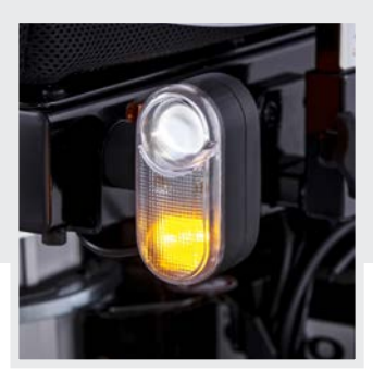
Active LED lighting