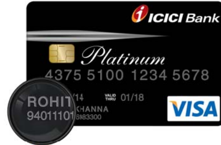
PAYBACK membership number

Now you can also redeem your PAYBACK points by calling the ICICI Bank 24-hour Customer Care.