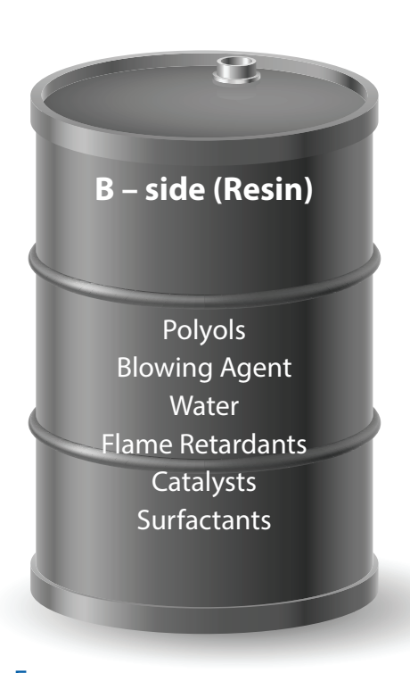
Components of Spray Foam