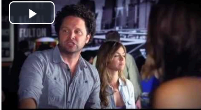
Miller Lite – Man Up

Example of Individual Student Post to the Online Forum: