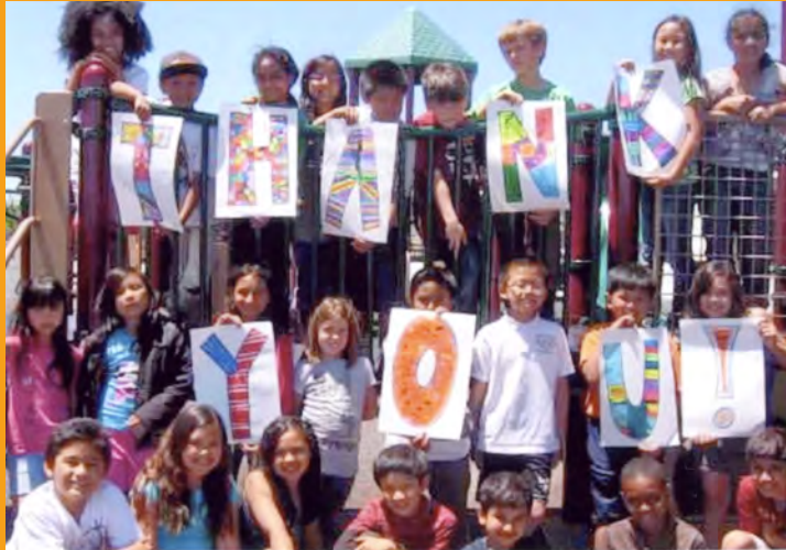
Photo collages of students