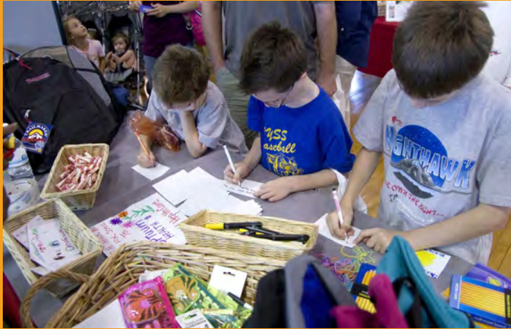
Photo collages of students