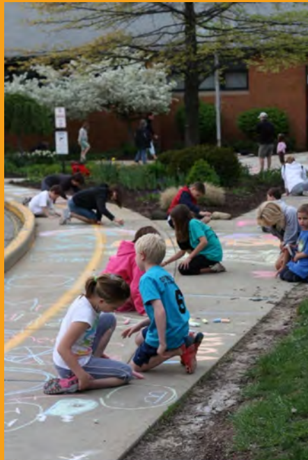
Photo collages of students