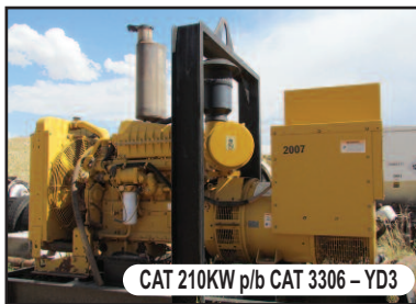
CAT 210KW p/b CAT 3306 – YD3