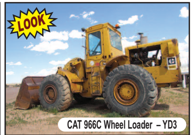
CAT 966C Wheel Loader – YD3