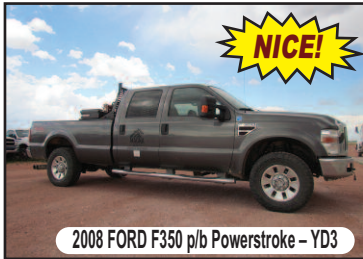
2008 FORD F350 p/b Powerstroke - YD3