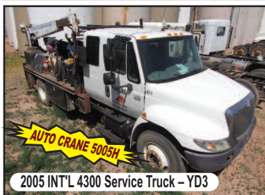
2005 INT'L 4300 Service Truck – YD3

'95 PETE 379 T/A Vac Truck p/b CAT Diesel, FULLER 13-Spd, MASPORT Vac Pump