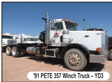
'91 PETE 357 Winch Truck – YD3