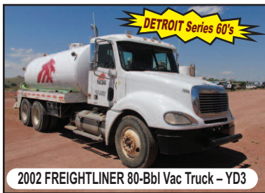
2002 FREIGHTLINER 80-Bbl Vac Truck – YD3