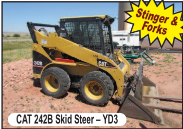
CAT 242B Skid Steer - YD3

WEDNESDAY • AUGUST 31st, 2016 • LOVELAND, CO • 9:00AM (MDT)