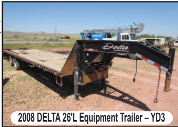
2008 DELTA 26'L Equipment Trailer - YD3