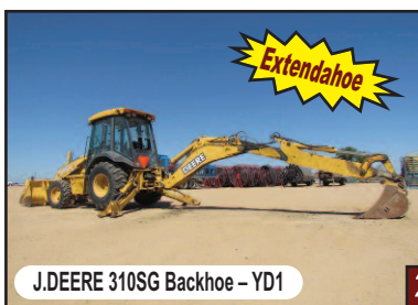
J.DEERE 310SG Backhoe – YD1