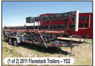
(1 of 2) 2011 Flarestack Trailers - YD2