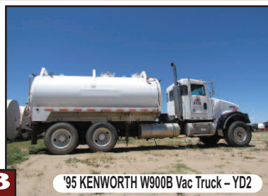
'95 KENWORTH W900B Vac Truck – YD2