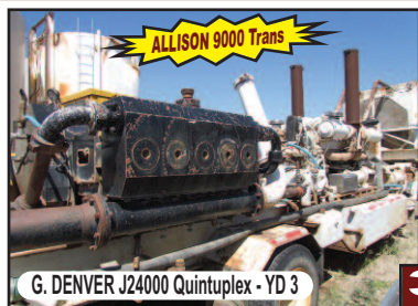
G. DENVER J24000 Quintuplex - YD 3