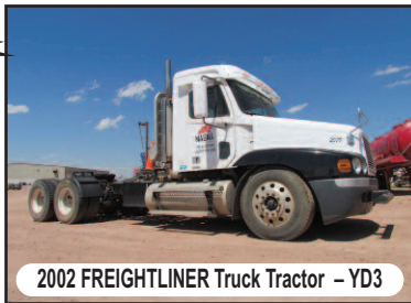
2002 FREIGHTLINER Truck Tractor – YD3