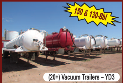
(20+) Vacuum Trailers - YD3