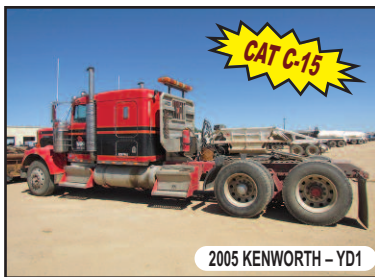
2005 KENWORTH – YD1