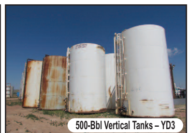
500-Bbl Vertical Tanks – YD3