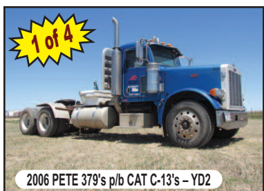
2006 PETE 379's p/b CAT C-13's – YD2