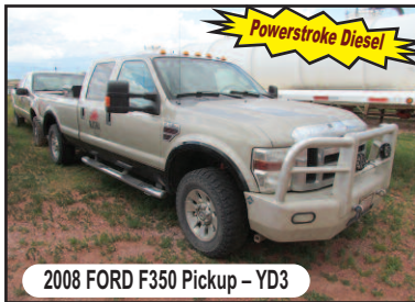
2008 FORD F350 Pickup – YD3