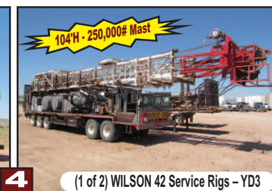
(1 of 2) WILSON 42 Service Rigs – YD3