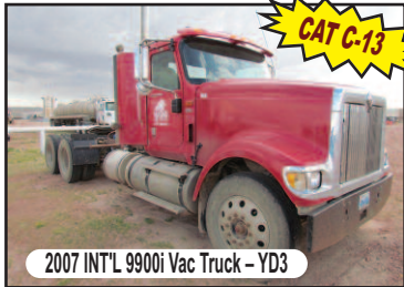
2007 INT'L 9900i Vac Truck - YD3