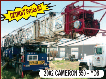
2002 CAMERON 550 - YD6