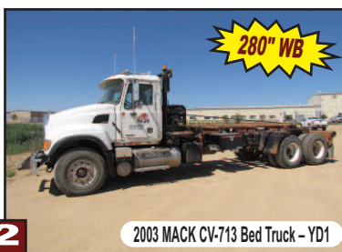
2003 MACK CV-713 Bed Truck – YD1