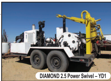
DIAMOND 2.5 Power Swivel – YD1