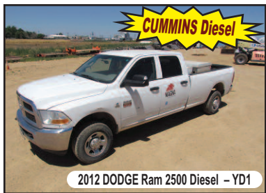
2012 DODGE Ram 2500 Diesel – YD1