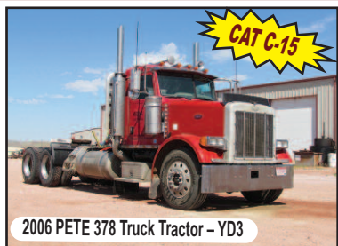
2006 PETE 378 Truck Tractor – YD3