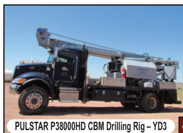
PULSTAR P3800HD CBM Drilling Rig – YD3