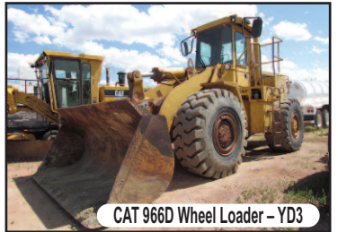
CAT 966D Wheel Loader - YD3