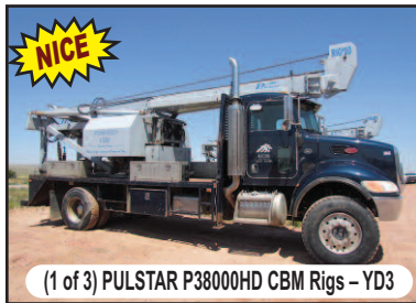
(1 of 3) PULSTAR P3800HD CBM Rigs – YD3