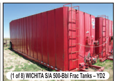
(1 of 8) WICHITA S/A 500-Bbl Frac Tanks – YD2