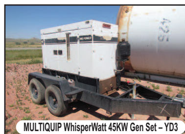
MULTIQUIP WhisperWatt 45KW Gen Set – YD3