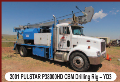
2001 PULSTAR P3800HD CBM Drilling Rig - YD3