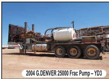
2004 G.DENVER 25000 Frac Pump – YD3