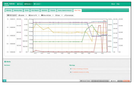
Figure 7. IDOL Admin dashboard