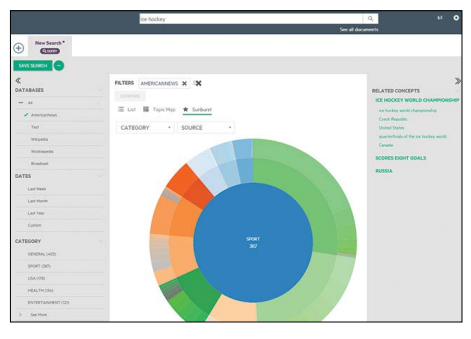
Figure 4. Filter based on extracted entities (people, place, company) from data

Figure 3. Key concepts with easy drill-down