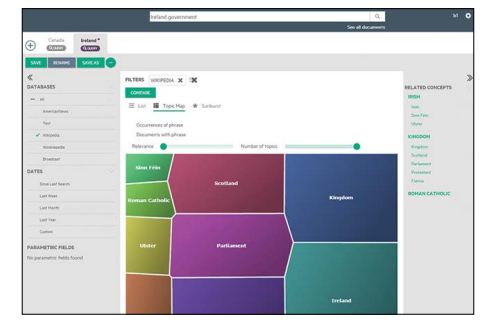
Figure 3. Key concepts with easy drill-down