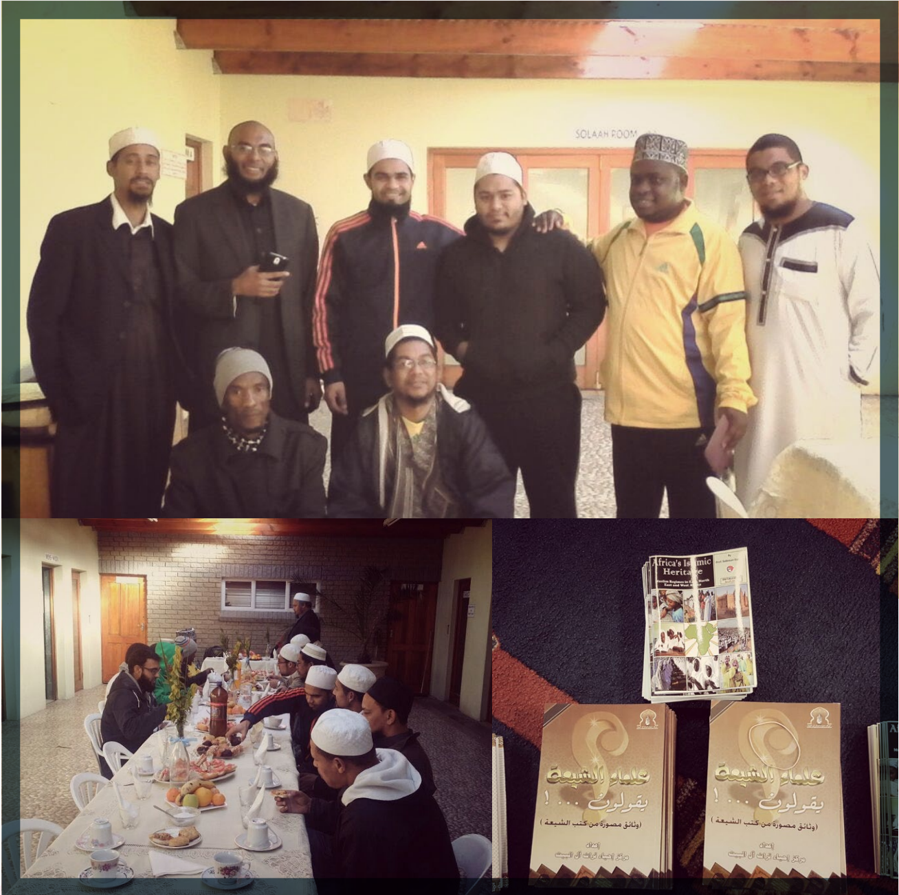
IDP CT Imams – Presentation of R1000 gift vouchers, books & duvet set – 6 June 2015