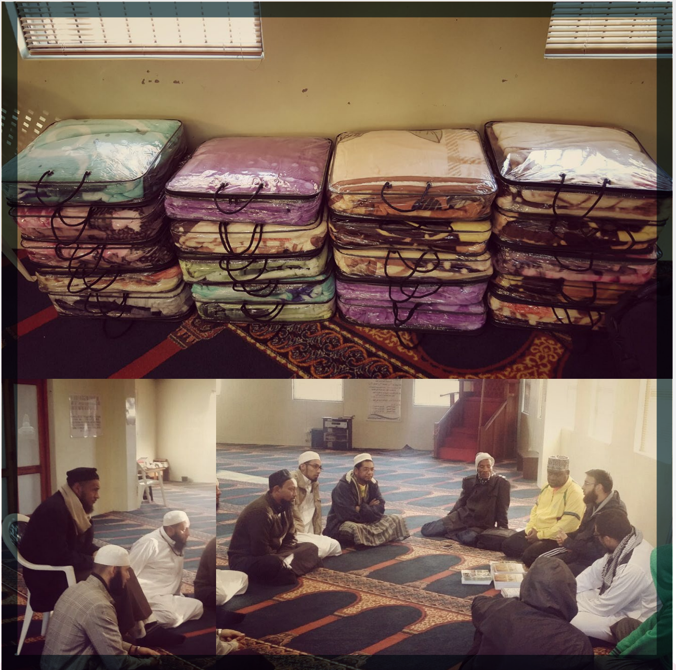
IDP CT Imams – Presentation of R1000 gift vouchers, books & duvet set – 6 June 2015