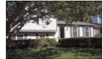
Fairfax Sunroom $503,900 The beautiful sunroom on the main level is just one of the many wonder- ful reasons to own this home. Gleaming hardwood on two levels, brand new carpet on the bedroom and rec room level, breathtaking back yard, patio and decking and a one car garage in the Woodson HS district.

Access the Realtors Multiple Listing Service: Go to www.searchvirginia.listingbook.com