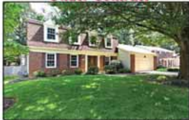
Fairfax • George Mason Forest • Updated w/Pool • $689,900