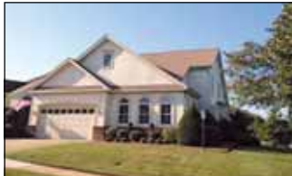
Gainesville Heritage Hunt 55+ (50+ ok) $579,900 Pristine 3 lvl 'Yardley' - water & mountain views! 3BR, 3.5 BA, HDWDS, Main lvl MBR, Grmt Kit w island & Silestone, Liv, Din, Brkfst, Fam, Scrm porch, Storage, wrp/ arnd Deck, 2 car Gar, HOA inc PH/Intnt/Cable/Trash & Fitness.