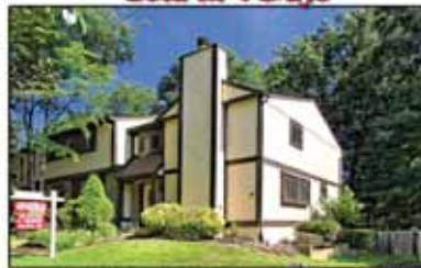
Burke • Burke Centre • Updated Gourmet Kitchen • $349,000