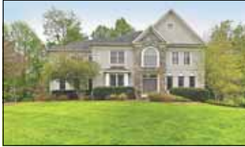
Clifton - $1,249,000 Beautiful Custom Home on Delightful 2+ Acres

View more photos at www.hermandorfer.com