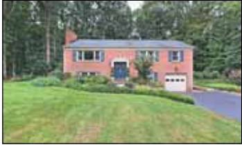
Clifton - $679,000 Open Floor Plan; Loads of Updates; Perfectly Sited on 1 Acre!

C.A.R.O.L. Hermandorfer Associates Top 1% of Agents Nationally