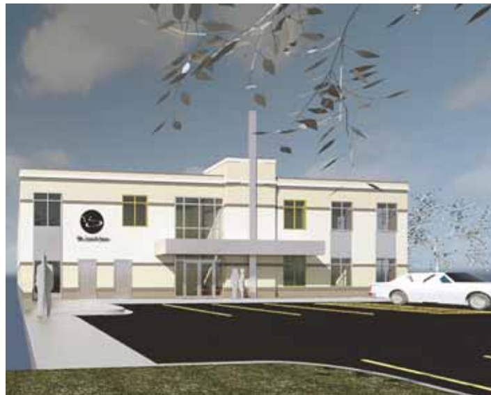
Artist's rendition of the new Lamb Center in Fairfax.