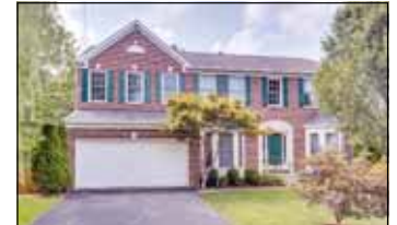
Clifton $647,000 Better than new! Shows like a model! Hardwoods on 2 levels, 9' ceilings, chef's granite and island kitchen! King sized master suite, incredible fin LL w/man cave, bedroom and so much more! Desirable North Clifton location - easy commute, great schools, walk to shops, and 27 holes of golf close by!

MARSHA WOLBER Lifetime Member NVAR Top Producers Top 5% of Agents Nationally www.marshawolber.com Cell: 703-618-4397