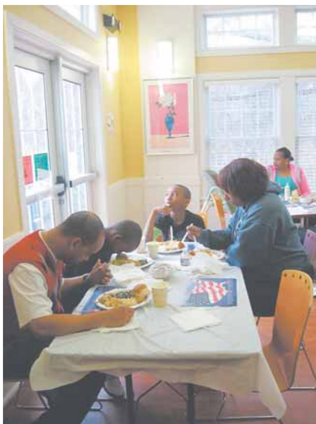
A father and son pray before eating their Thanksgiving meal, served at the Katherine K. Hanley Family Shelter by Gov. Terry McAuliffe on Thursday, Nov. 27, in Fairfax.