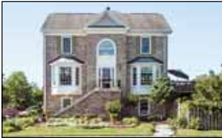
Alexandria Kingstowne $549,900 Beautiful 3-lvl brick TH, 3BR, 3.5BA, Updtd Baths, new paint, Fin W/Out LL w Fpl, Kit w gran & St St apps, Fam rm off Kit, MBR w vault ceilg, new win- dows, 2 car Gar, close to schools, stores & Metro MOTIVATED SELLER