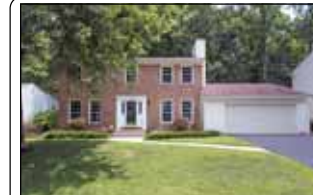
Burke $549,999 There's No Place Like Home Don't let the proximity to shopping, dining and transporta- tion fool you - this home offers a retreat from the hustle and bustle of life in our region. With access to miles of walking/biking trails outside your back door you can easily discover ponds and playgrounds, flora and fauna. This home is one of only a few on the street that backs to trees and not another house. Your private oasis in Burke.