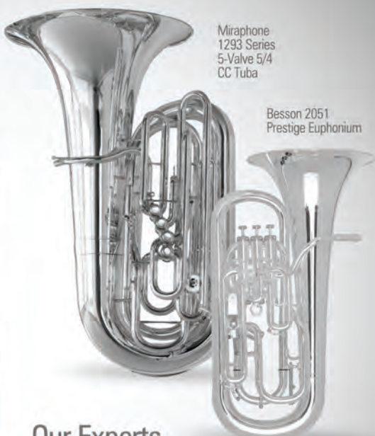
Miraphone 1293 Series 5-Valve 5/4 CC Tuba