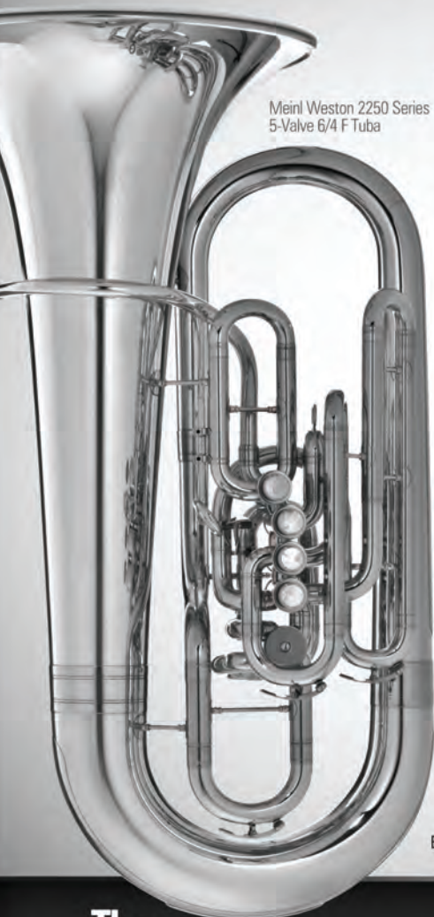
Meinl Weston 2250 Series 5-Valve 6/4 F Tuba

Largest Selection | Best Prices | Expert Advice