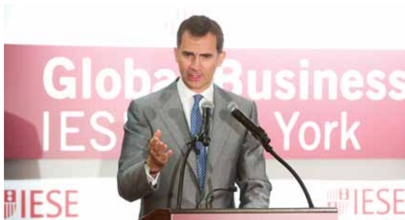
His Royal Highness the Prince of Asturias