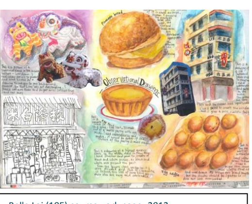
Belle Lai (10E) coursework page, 2012

Students who put in the time make fast progress in their technical skill, so those concerned about their current ability should not worry too much. More important is a strong work ethic and a commitment to spend at least 2 hours per week on their artwork outside of class.