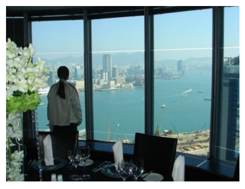
View from HSBC's Asia Headquarters

Assessment : Candidates will take 2 exam papers (each worth 40% of total marks) plus an additional coursework component (worth 20% of total marks). Pupils may opt out of the coursework component, in which case the weighting of each of the exam papers increases to 50%.