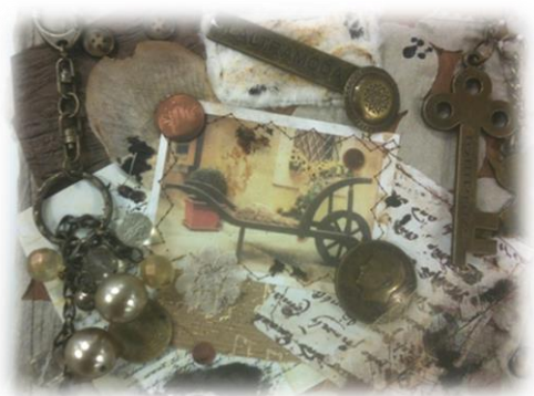
An example of recent Y9 work

Content: Pupils learn to explore, analyse, and create their own artwork and work independently on individual ideas. Students will experience some of the following disciplines: Printed and/or Dyed Fabric: Students will become aware of a variety of printing techniques using a range of media in execution. These include Image transfer through Heat Pressing, Batik, Tie Dye, Block printing, mono printing, screen printing, stencil printing.