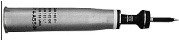
Nexter 105 mm OFL G2 APFSDS-T round

Nexter Munitions (formerly Giat Industries) also produced a 105 mm OFL 105 F2 APFSDS-T with a depleted-uranium (DU) penetrator rod; see below for details.