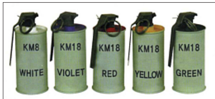
Current production standard Hanwha KM18 coloured smoke grenades (Hanwha)