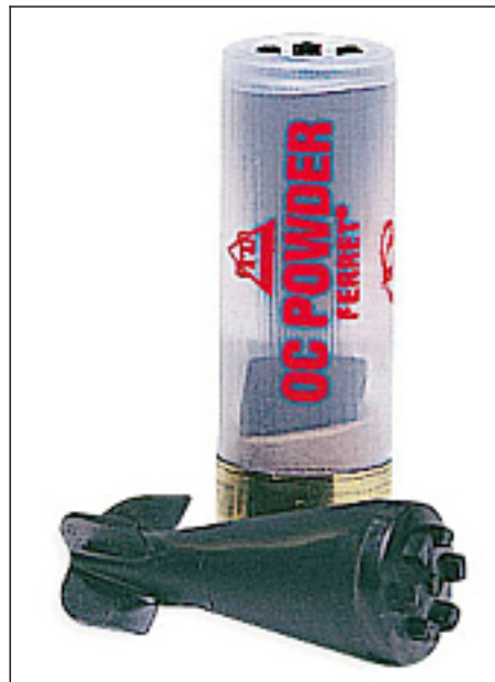
12-gauge Ferret®-12 powder OC round (Defense Technology) 1153627