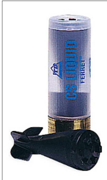
12-gauge Ferret®-12 liquid CS round (Defense Technology) 1153624

The Ferret®-12 is available with liquid or powder carriers for the agent, in either CS, CN or OC forms. Liquid carriers, which contain red dye to aid in shot placement, are heavier, improving their barricade penetration. Powder carriers tend to keep the agent airborne for longer and may therefore be more effective. Practice rounds with inert contents are also available.