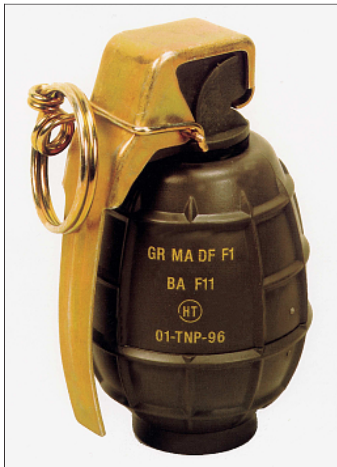
LU 213 HE-APERS-FRAG hand grenade

An inert ballasted hand grenade is available for demonstration and drill purposes. The exterior shape is identical to the LU 213 anti-personnel grenade, but the inert body is coloured orange and is equipped with an inert fuze assembly. A safety device is placed at the base of the priming system so as to prevent fitting a live fuze into the inert grenade body.