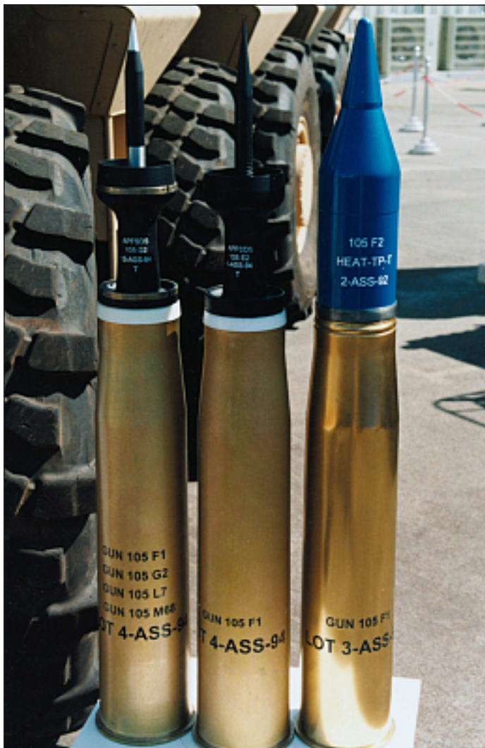
Nexter 105 mm OFL G2 APFSDS-T round (left), compared to the F2 APFSDS-T round (centre) and the F2 HEAT-TP-T round (right) (T J Gander)