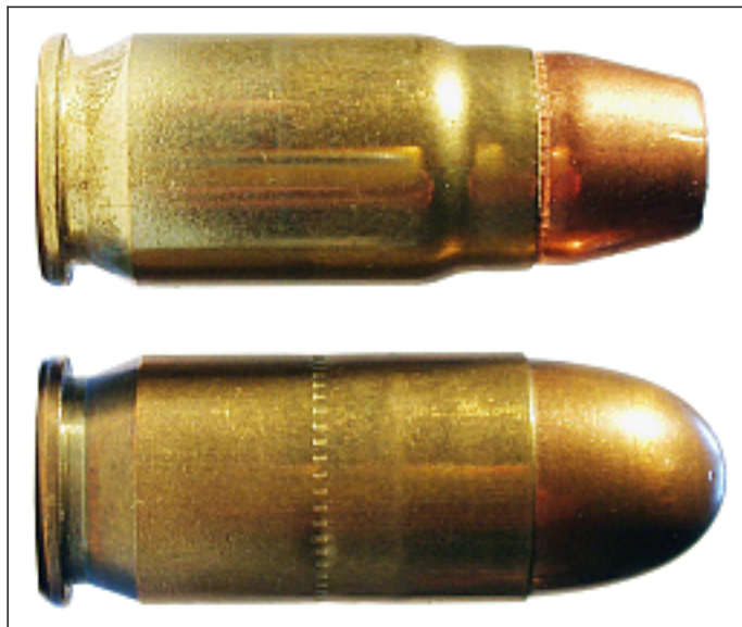
400 Cor-Bon cartridge, top, compared with the.45 ACP, bottom