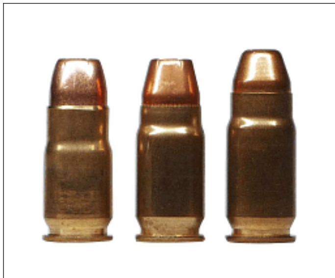
10 mm Centaur; .400 Cor-Bon; .40 Super (Anthony G Williams)

Suitably chambered semi-automatic pistols.