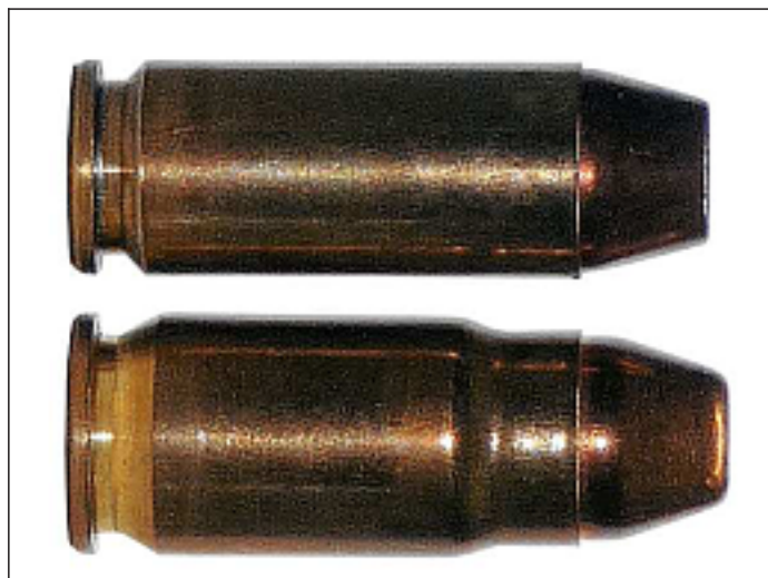
.40 Super (bottom) compared with 10 mm Auto (Anthony G Williams) 1395524

220 grain HCFN: hard cast flat nose; 14.25 g; MV 411 m/s.