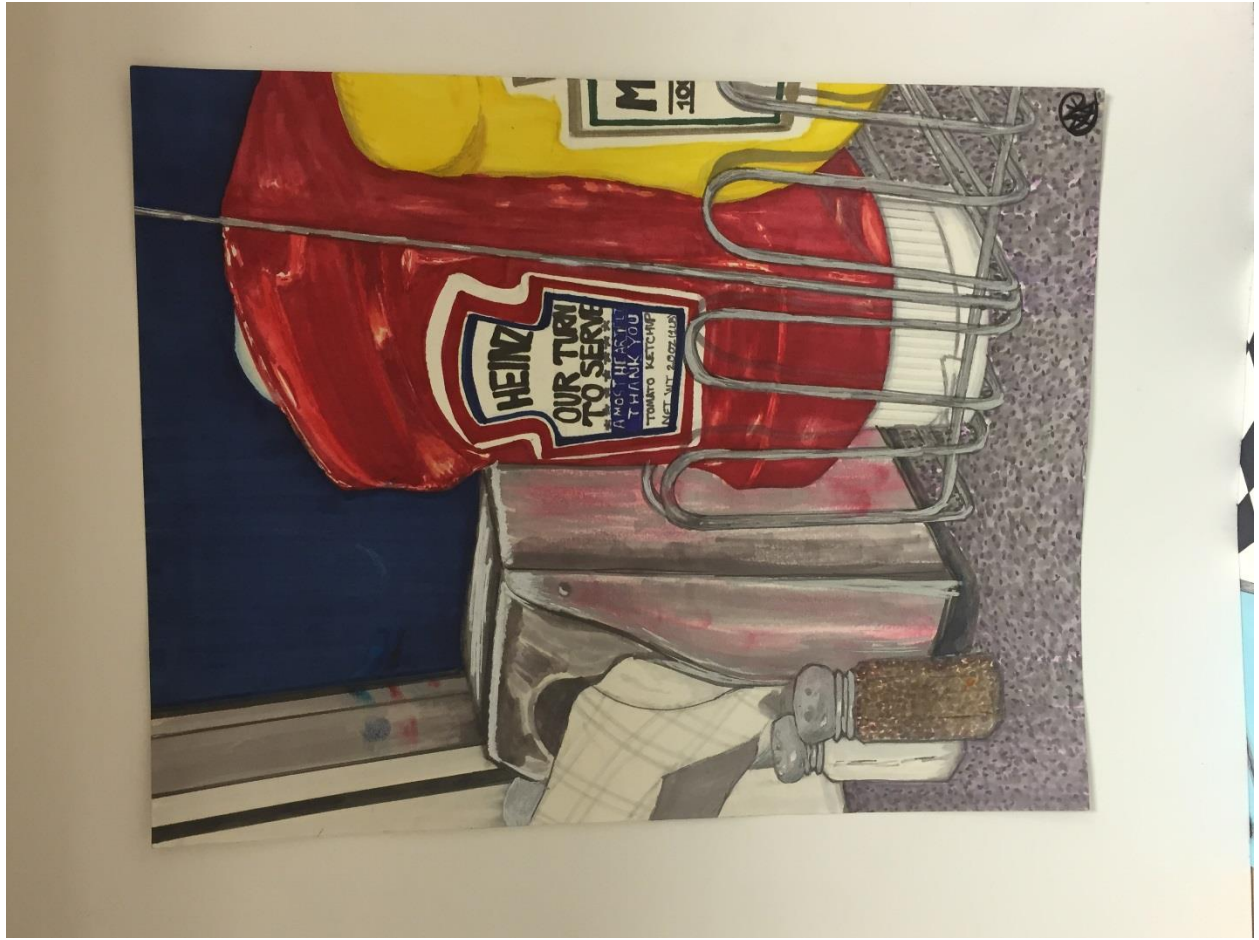
Student still life