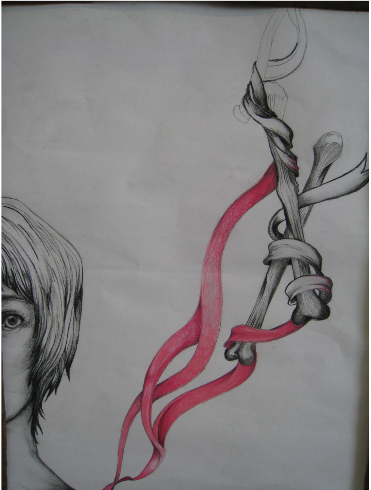
Student interesting portrait