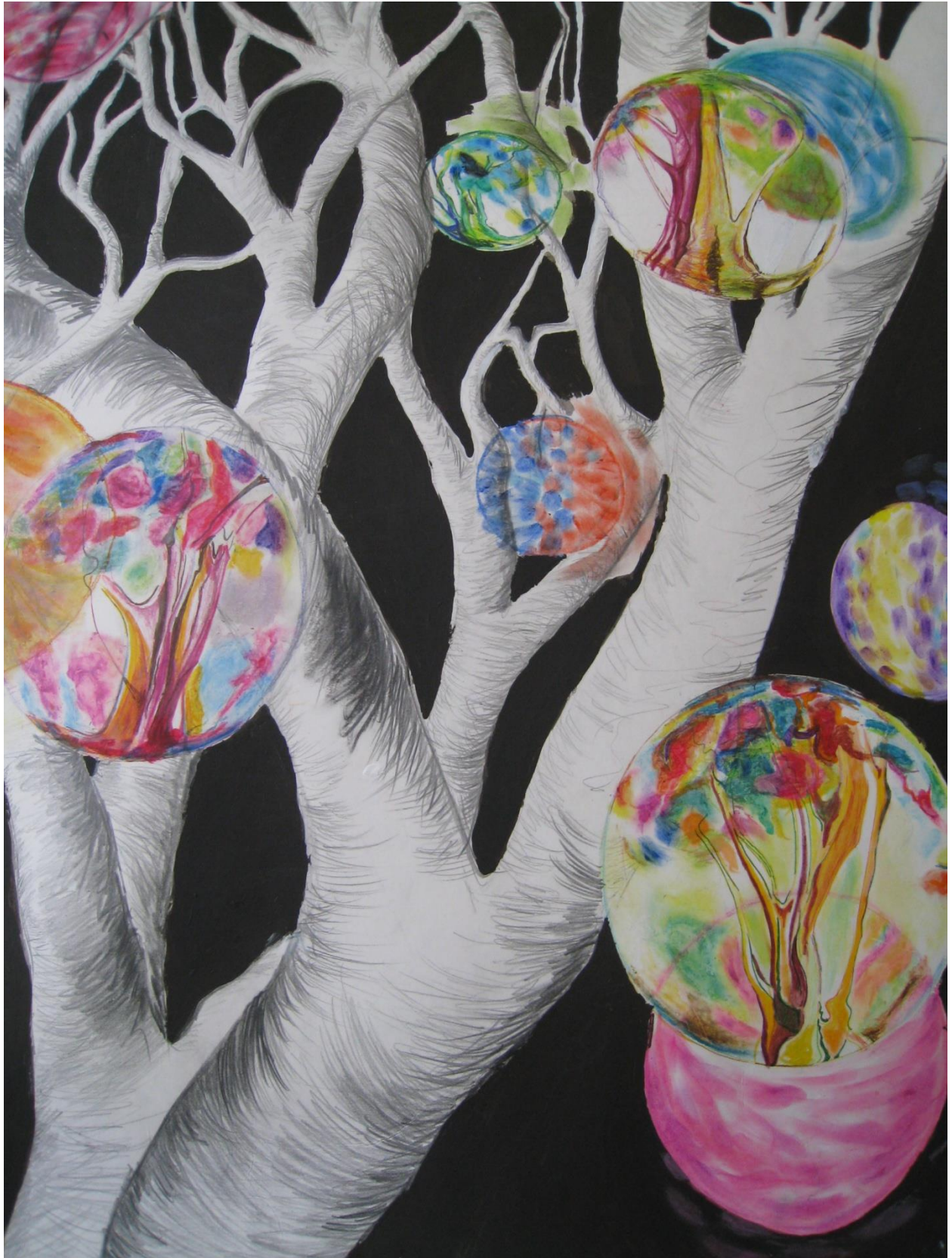
Student still life abstraction from realism