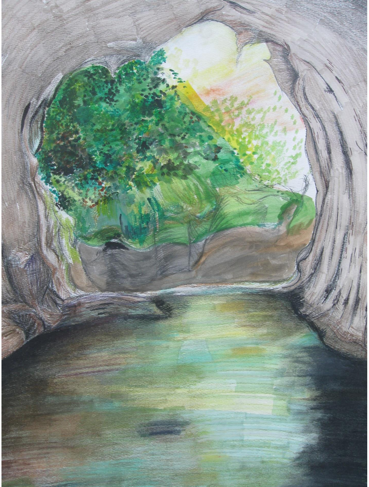
Student Impressionism style landscape