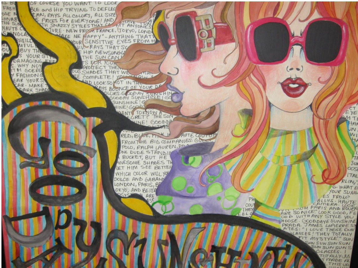
Student portrait with an interesting angle