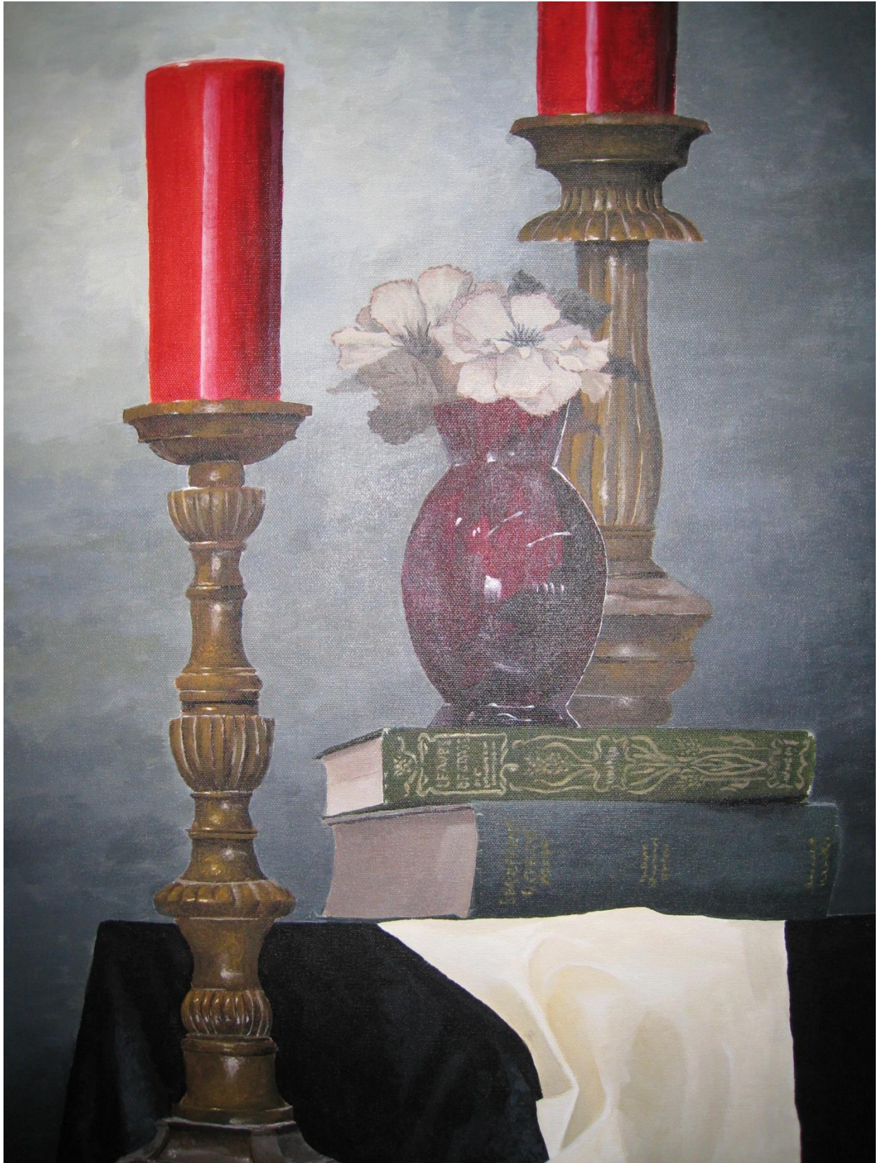
Student Still life