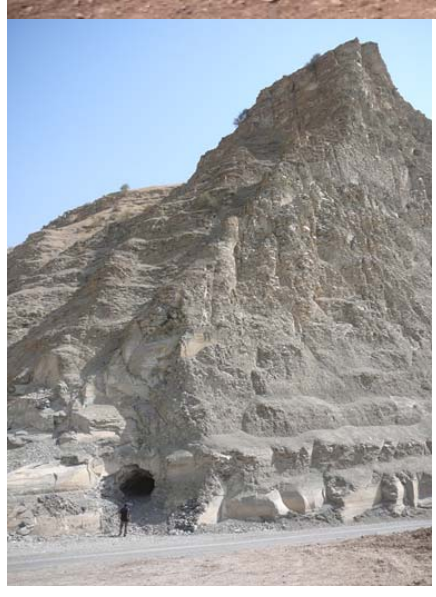
Photo 15: Construction site area. Location of the future diversion tunnel

Only part of the affected area of the Tigris valley near the Ilisu construction site has been surveyed. Road construction and the installation of other logistics infrastructure, however, have been carried out without the presence of the chance find archaeologists. Surveys in the affected areas should be carried out immediately.