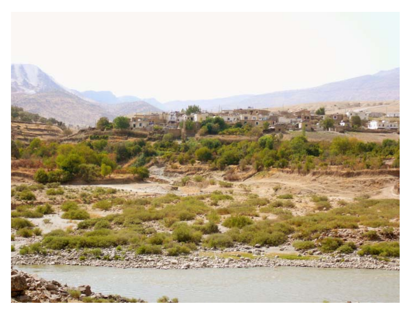
Ilisu Hydropower Project, Turkey