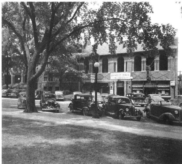
Bradley Hall on Wright Street, south of Green Street, circa 1936

The project also enhances research collections in the Student Life and Culture Archival Program through