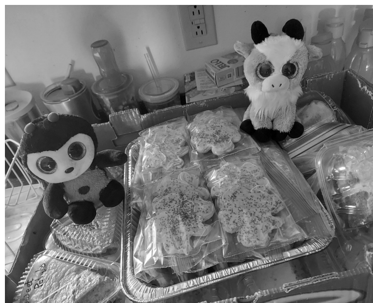
Going along to help Emerald Mound Grange with their dessert sales at Summerfield Lion's Club Friday fish fry. YUM