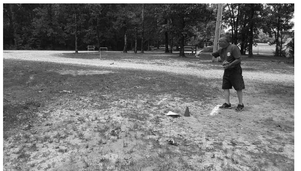
Don in Olympic Games