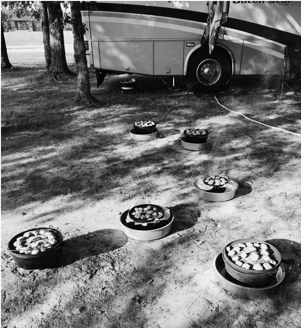
All the dutchovens making desserts