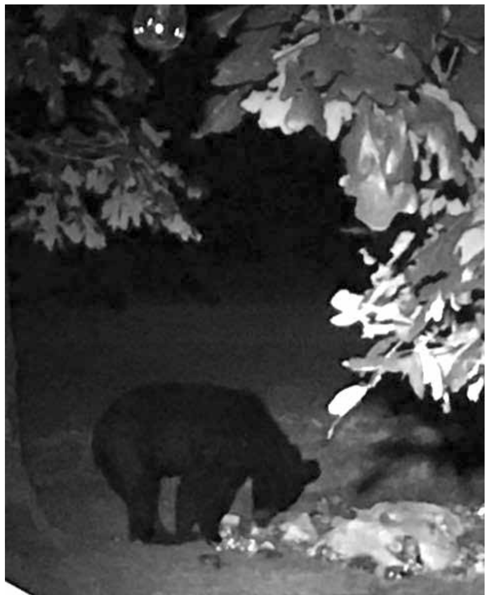
The Nightly visitor bear - we named Oliver