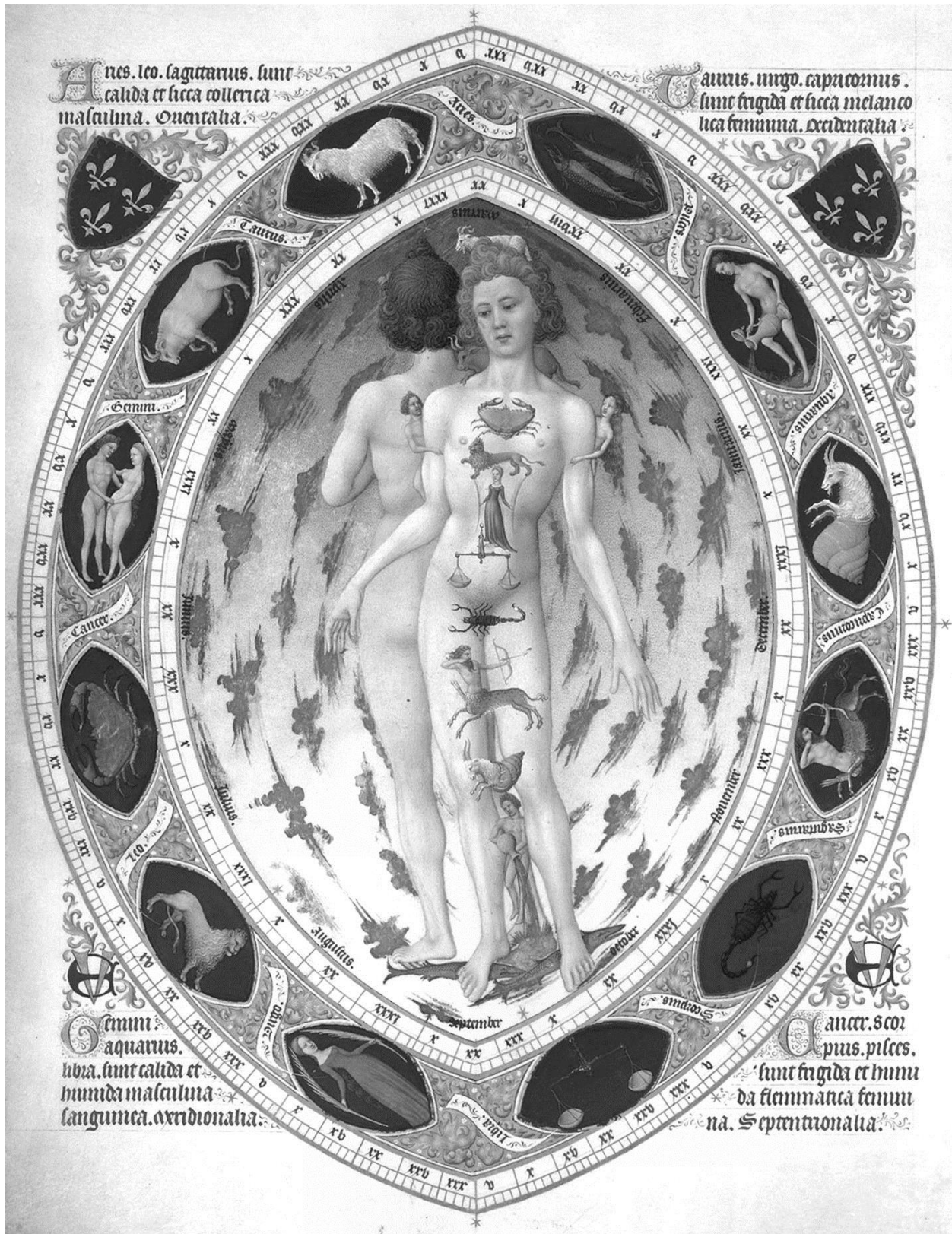
Anatomical Man by the Limbourg Brothers (1411-1416)