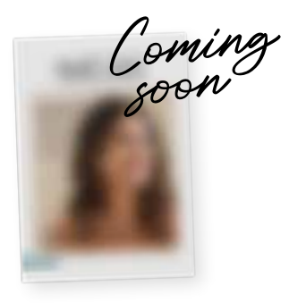
IMCAS AMERICAS SUMMER 2022 CARTAGENA & ONLINE