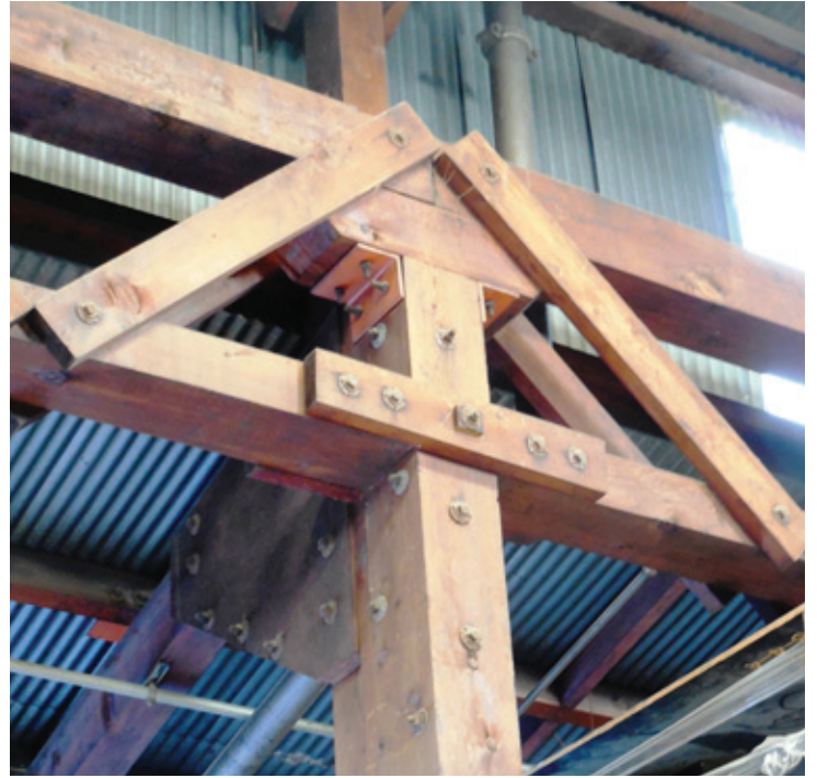
These sturdy wooden and metal trusses in building 1 are part of the bones of Marina historic buildings. Their immense strength opens up vast spaces clear of pillars and walls so businesses such as "Hot Rod X" can install trolleys to move heavy theatrical sets and installations for museums and major corporations. They also rent buildings 6, 8, and 33 for offices and storage.

with nary a bracket, to keep your eyes from sliding right off. But more careful study with sympathetic hearts revealed the place as a cultural treasure, with uniformity of decoration, understated but endearing lines, open spaces enriched with statuary, and a mess hall entrance enlivened with oval columns. Even the landscaping has history, redacted from the Treasure Island 1939 Fair.