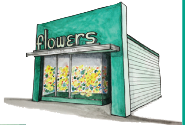
Select Alameda landmarks have been captured in Stephen Sèche's whimsical illustrative style.