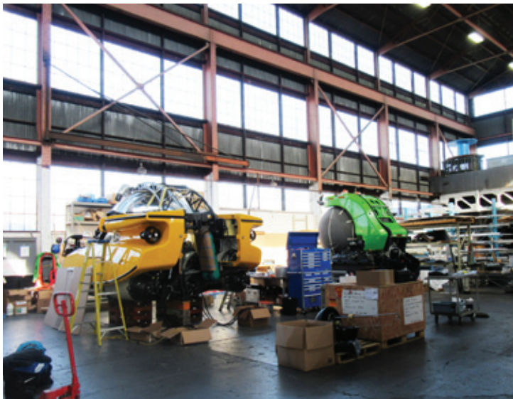
Building 19 is the multi-story showpiece of the Marina; its vast reaches welcomed the submersibles being produced by Deep Ocean Exploration and Research (DOERS).

Much the same bewilderment applied years ago when the Naval Air Station (NAS) was decommissioned. These pre-mid-post WWII buildings were unappealing,