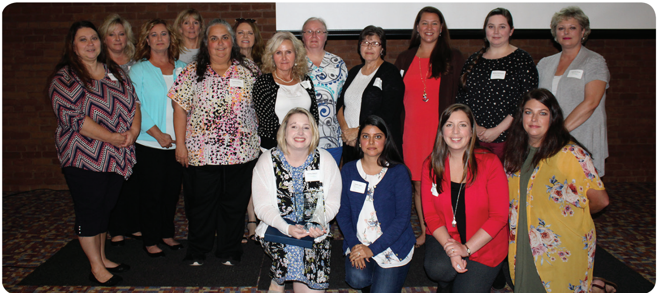
▲ North Georgia Health District I-2

Congratulations to all the recipients from this year's conference. We thank you for your continued efforts to protect and immunize Georgia.