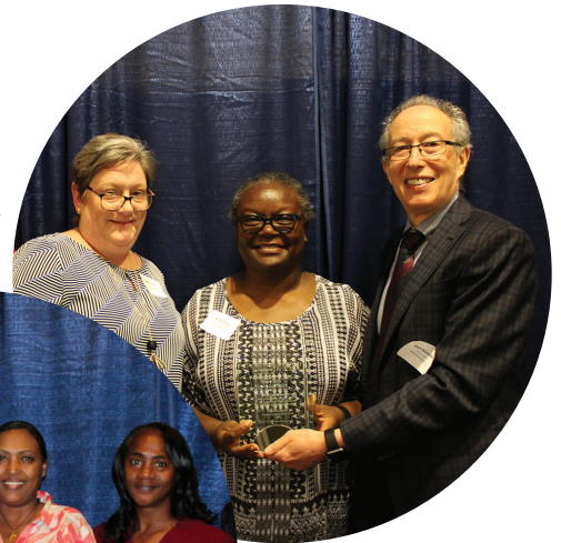
▶ Albany Area Primary Healthcare

The staff at the Dekalb County Board of Health, Clifton Springs Health Center show care and humanity in the service they provide to their clients. They make efforts