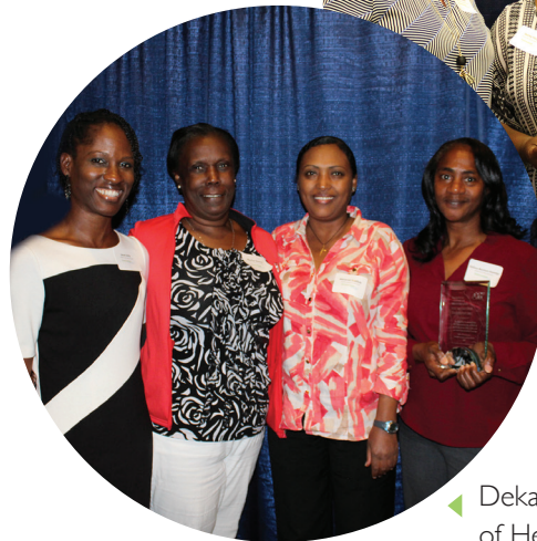
◀ Dekalb County Board of Health, Clifton Springs Health Center