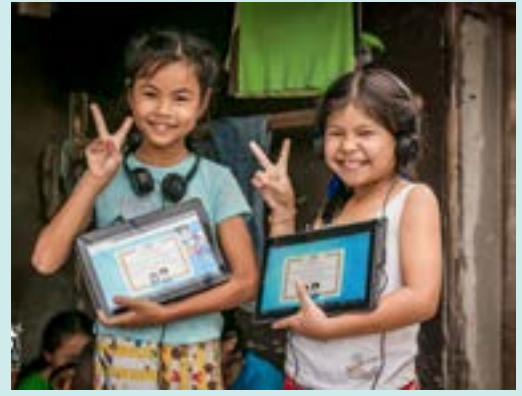
Students of the Baan Dek Foundation's Digital Superheroes Academy learn about life skills such as child rights in Chiang Mai, Thailand.