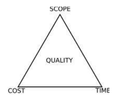
Figure 1.1 : Project Triple Constraint

The triple constraints have their own respective effect on the project's performance, they have correlation with each others, anyone constraints has bears effect on the other two (Brewer and Dittman, 2010). If a change happens on a constraint, another two constraints also will influence by the changes. The Figure 1.1 shows project triple constraints as follows: