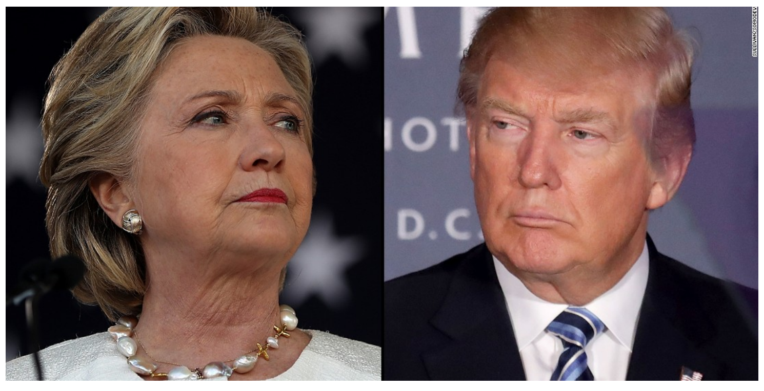
RELATED ARTICLE Two Princeton professors walk through your election anxiety

True, Clinton is no longer a Cabinet officer. She is currently a private citizen. But the logic and spirit of Article II make former Cabinet officers fully impeachable, as are other former officers of the US government – ex-presidents, ex-vice presidents, former judges and former justices, for example. Why? Because the punishment for impeachment can extend beyond simple removal from office. Under Article I, Section 3, "judgment in cases of impeachment" may include "disqualification to hold or enjoy any Office of honor, Trust, or Profit under the United States."