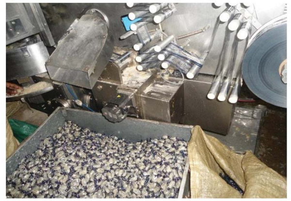
Fig 2 Typical automated manufacturing sweet wrapping machine

In view of the low level TQM standards, the main thrust of TPM trainers' early work involved improvements to routine maintenance and work practices. They worked with elected individual production teams to identify all areas of the machines that had to be lubricated, cleaned, adjusted or otherwise regularly maintained. A picture of a clean and well—maintained machine is shown in Fig 2 below.