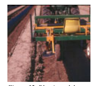
Figure 32. Plastic mulch layer on compact tractor.

Plastic mulch layer The use of plastic mulch is a common practice for nearly all strawberry growers, many vegetable growers and some home gardeners. Plastic mulch may be used with a fumigant and drip irrigation. Plastic mulch layers (Figure 32) that mount on compact tractors are available to mechanize these operations.