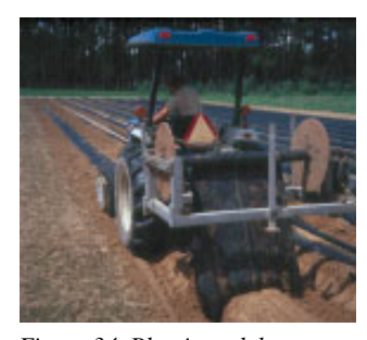
Figure 34. Plastic mulch collector on compact tractor.

(constantly) by an operator riding on the machine. A design developed by the LSU AgCenter (Figure 34) senses the tension on the plastic and automatically adjusts spool speed to provide relatively uniform torque loading on the spool. An entirely different design uses rollers to feed the plastic sheet into a big wire cage instead of rolling it up.