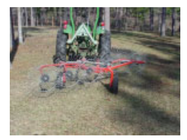
Figure 38. Rake for lawns and pine straw on compact tractor.

A wheel-type pine straw rake can be pulled by a small tractor, a riding mower, a utility vehicle or an ATV. Proper adjustment