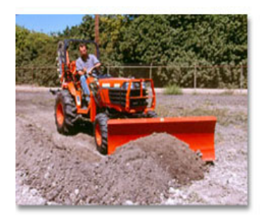
Figure 7. Front blade on compact tractor.

Raising and lowering the front blade is done in different ways. Some models use a hydraulic cylinder; others are linked to the 3-point hitch. The