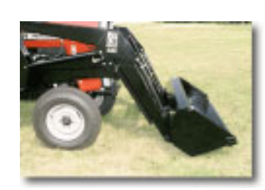
Figure 22. Front-end loader on compact tractor.

products, carry bags and other bulky items, lift equipment (using a chain), move hay bales, lift pallets and even do light grading. Not all compact tractors are equipped with the necessary hydraulic connections for a loader, so be sure you check on hydraulics if adding a loader