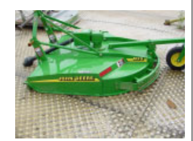
Figure 29. Rotary cutter for compact tractor.

pact tractors) and are designed for heavy, rough cutting. They are not designed to mow grass as short as is common for lawns and should not be set to cut lower than about 3 inches. They will cut light brush (1 to 2 inches in diameter, depending on model). They are not highly maneuverable