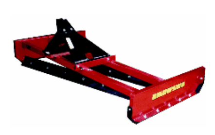
Figure 18. Grader blade for a compact tractor.

7 feet. It is important that the 3-point hitch be properly adjusted to keep the implement level. There are no moving parts to replace. Like any blade, there are different quality levels available; it is worthwhile to get one that is heavy