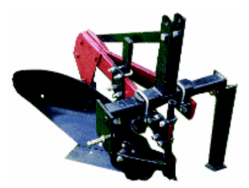
Figure 35. Moldboard plow for primary tillage.

the plow bottom twists and fractures the soil, leaving it loose and friable (if the moisture is right). Surface vegetation is buried and the inverted soil is broken up somewhat. In most soils, compact tractors will be able to handle only one or two bottoms, although draft depends on soil