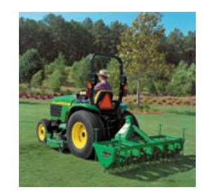
Figure 1. Turf aerator on compact tractor.

thatch decomposition. Dethatchers are similar machines, but generally use spring tines to rake up thatch rather than slicing or puncturing the thatch and soil. Some machines have two kinds of tines to perform both operations. The overall purpose of these machines is to reduce thatch in turfgrass.