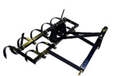
Figure 19. Spring-tooth harrow for compact tractor.

Spring-tooth harrows (Figure 19) are the most aggressive. The tines can be C-shaped tines as shown in Figure 19 or S-shaped ("Danish") tines that provide side-to-side vibration. The tines can be tipped with points or small sweeps. Sweeps do a better job of uprooting all weeds. The spring tines of either type