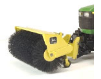
Figure 8. Rotary broom on compact tractor.

parking lots. They are often used in the North for removing light snow. This implement would be of little value to most farmers or homeowners, but it might be of value to a contractor. Many widths and brush diameters are available. The drive can be mechanical or hydraulic. The broom is usually run at an angle so material is swept to the side.