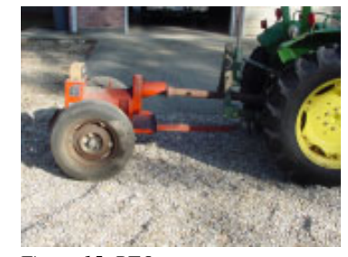
Figure 15. PTO generator on compact tractor.

idea of the maximum size of generator your tractor can handle. Because the generator is not 100% efficient, you will probably not be able to actually deliver quite that much power. On the other hand, you can always buy a generator that is rated a little too large for your tractor,