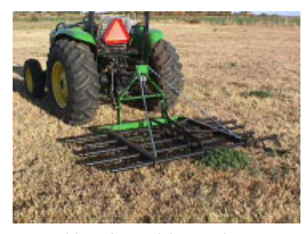
Figure 20. Spike-tooth harrow for compact tractor. (Photo from

They can be pulled from the drawbar or mounted on a 3-point hitch. A drawbar hitch is less expensive, but it complicates transport. The angle of the teeth can be adjusted from vertical to angled back almost flat. The more vertical the teeth, the more aggressive the action.