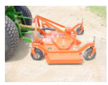
Figure 25. Heavy-duty finishing mower on compact tractor.

Height is controlled by four gage wheels (two wheels on cheap models). These mowers vary greatly in quality with corresponding price differences. This is a case where it is worthwhile to buy a high-quality mower with a heavy deck, four heavy gage wheels, heavy frame and heavy power transmis-