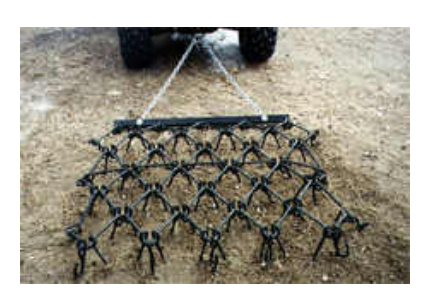
Figure 21. Chain harrow for compact tractor.

Chain harrows (Figure 21) are offered by several companies. They are popular for landscape use and are used in agriculture. They are flexible and do a good job