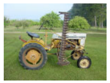
Figure 30. Sicklebar mower on small offset tractor.

They are useful for reaching down into ditches or up onto a slope while the tractor remains level. They will cut tall material without plugging. They require little power. They do not cut or shred the cut material, so the full-length clippings will be left lying on the ground. Although sicklebar mowers usually