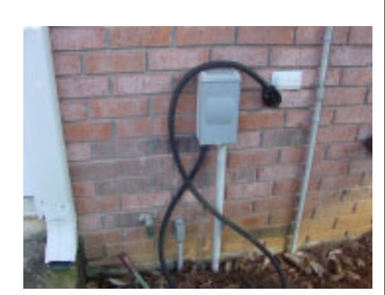
Figure 17. Large cord and plug to connect house transfer switch to PTO generator.

Maintenance on a PTO generator is pretty simple: keep it sheltered and out of the weather, be sure the tires are aired up (unless permanently mounted on a pad or mounted on a 3-point hitch), and grease any fittings on the powershaft or other drive components.