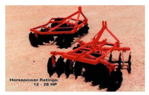
Figure 14. Disk harrows for compact tractors.

rear gangs move it back toward the center. The angle of the individual gangs can be changed to make the disk more aggressive; the greater the angle, the more aggressive the disk.