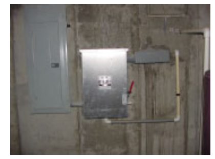
Figure 16. Transfer switch for safe switching between line power and

risking killing a utility lineman who is repairing the line. It also prevents utility power feeding back into your generator when the line power is restored. Consult your utility company and use only an approved transfer switch and have the installation approved by the utility com-