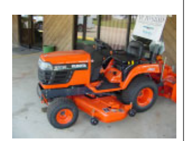
Figure 27. Mid-mount mower deck on subcompact tractor.

mowing. On some current models of tractor, it is now possible to leave a midmount mower in place while using a front loader or a rear-mounted implement such as a tiller; nevertheless, operating other implements with a mid-mount mower in place can compromise perfor-