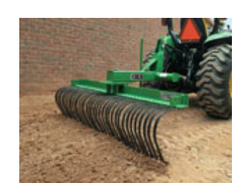
Figure 37. Landscape rake on compact tractor.

enough surface roughness to provide a good basis for seeding. Many landscape rakes are designed to allow them to be angled to the side – helpful in removing and windrowing rocks, trash or hard clods. A landscape rake should not be used to rake leaves, clippings or pine straw from turf. It is too aggressive and will damage the turf.