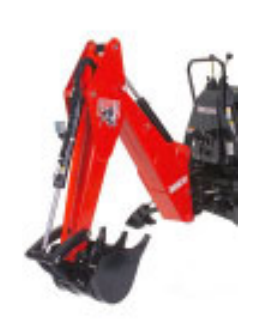
Figure 2. Backhoe for compact tractor.

hydraulic pump that mounts on the tractor PTO. Backhoes have four primary hydraulic functions (swing, inner boom, outer boom and bucket curl) plus hydraulic actuation of the stabilizers. In purchasing a backhoe, you will have two choices in controls: two lever and four lever (plus two levers for the stabilizers). Older operators who have used four-lever controls in the past may prefer that style, but the newer two-lever designs are generally easier to learn to use and becoming popular.