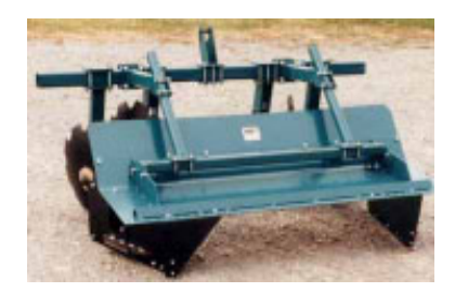
Figure 4. Bed shaper for compact tractor.

It is important to select a bed shaper that has sides tapering in from front to rear so that the sides of the