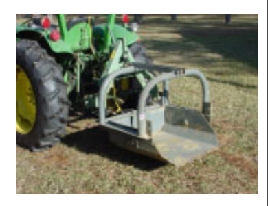
Figure 11. Dirt scoop on compact tractor.

scoop may be called by other names such as a rear bucket, slip bucket or slip scoop. It mounts on the 3-point hitch of a tractor. It is raised and lowered by the tractor, and usually has a manual dump, triggered by pulling a rope. The scoop or bucket can be reversed (by hitching to either end), thus allowing