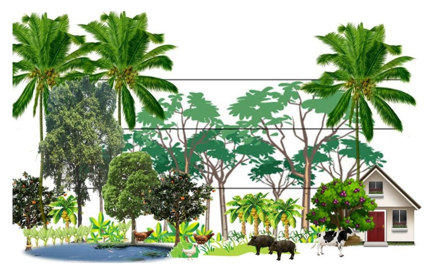
Fig.1 Tropical Homegardens: Multistrata composition of various components (Coconut, Mahogany, Papaya, Banana with intercropping of medicinal plants) with animal husbandry, piggery and fisheries component

Table.1 Traditional practices of homestead bamboo cultivation and their benefits to farmers (Based on Chandrashekara, 1996)