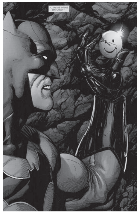
Figure 2. Watchmen becomes part of DC's regular narrative continuity in DC Universe: Rebirth (DC Comics, 2016).

We can no longer simply examine Superman and Batman as comics characters without ultimately taking into account the myriad ways in which they pervade popular culture across numerous media, and how they are consumed by more people in noncomic-book forms than through the pages of comics and graphic novels. Yet the various media extensions of those superheroes largely use the characters themselves, and not any one particular text, as the basis of the new material. The various extensions of Watchmen have been primarily centered on the original text and its narrative be they direct adaptations, prequels fleshing out smaller story or character details, or a video game that draws on the book's key settings. But as the corporate need for media franchises