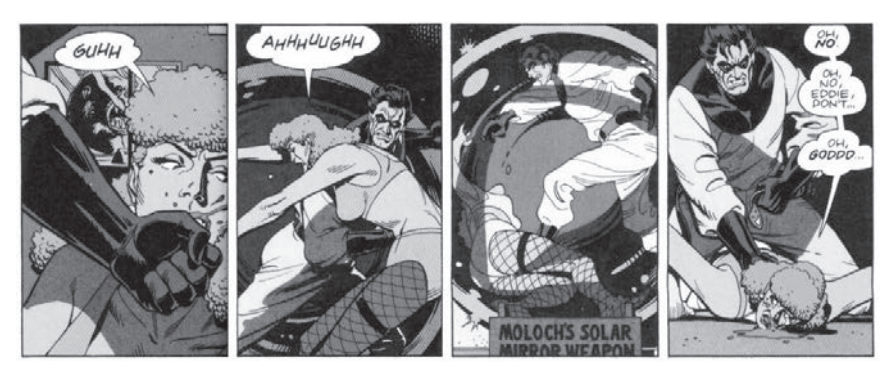
Figure 1. The Comedian attacks Sally Jupiter (Silk Spectre), from Watchmen (DC Comics, 1986).