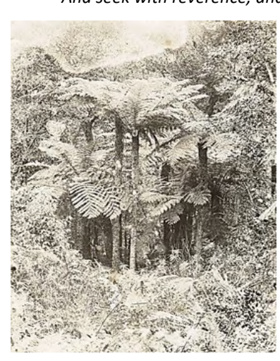
Tree Fern stand Northfield Estate Image 081444

A wilderness of deep descending woods! A sea of trees, whose shores are untrod mountains. Where silence sleeps 'midst purple solitudes. Save the lone murmuring of falling fountains. Unnumbered dawns have lit these peaks with glory, Millions o' tempests thundered round each height, And lesioned lightning scathed the forests hoary, Since first they blushed beneath Creation's light. The unknown mysteries of untold ages, Unbroken, guard their unrevealed lore; We trace God's impress on earth's mighty pages. And seek with reverence, and with love adore.