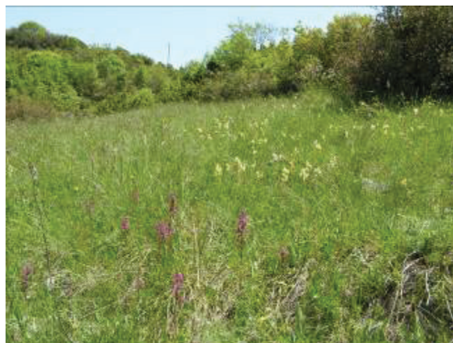
Figure 3. A glade of the in situ botanical garden with orchids