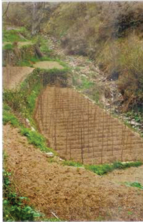
Figure 2. Cultivated terraces with traditional crops