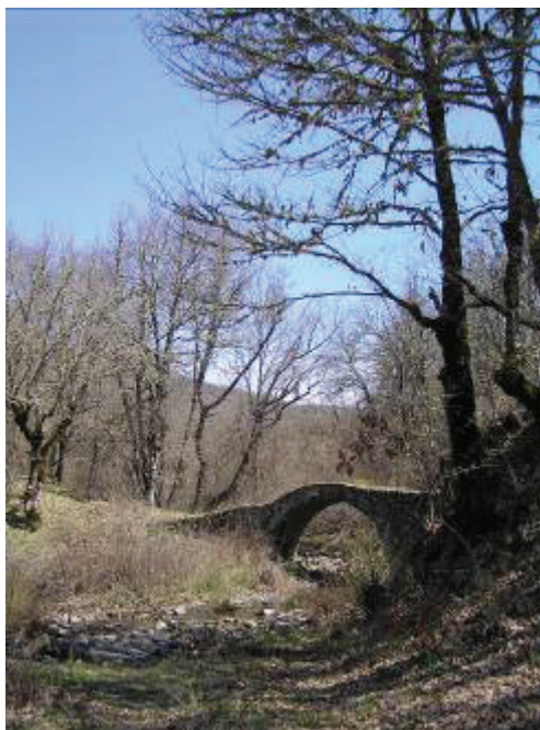
Figure 4. One from the two bridges of the garden