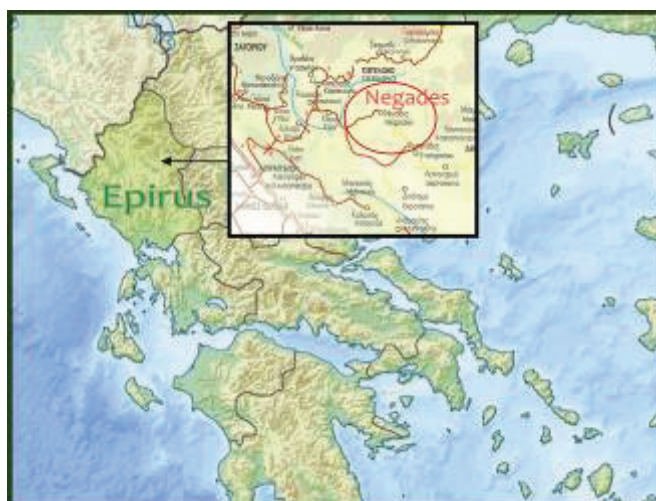
Figure 1. Map of the area