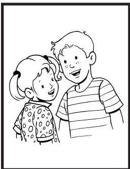
Lesson 7 LG 2

See them twinkling! Let's pick another star and see what happens. [ Pull down second star with family picture. ]