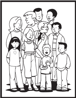
Lesson 7 LG 4

Look! [ Show picture. ] There's a picture on this star, too. It's a picture of a family. God wants us to tell others about Him. The people in the first church told their families about God. This is fun! What do you think will be on the next star? [ Allow kids to respond. ] Let's look for another star picture!