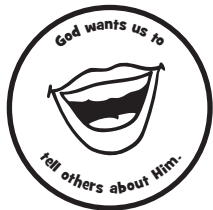
Lesson 7 SG 9