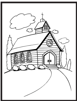
Lesson 7 LG 6

[Helper shines light all over, landing it on the invitation planet as the music ends.]