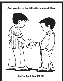
Lesson 7 SG 10