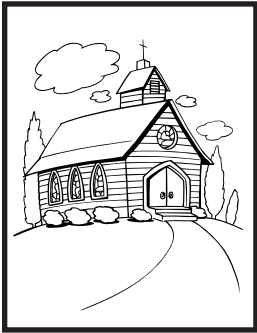
Lesson 7 SG 8

[Pass out a Church picture and crayon to each child. Encourage the children to draw a picture of themselves and a friend who doesn't come to church. Ask the kids to describe the friend(s) they drew and why they want their friends to come to church.]