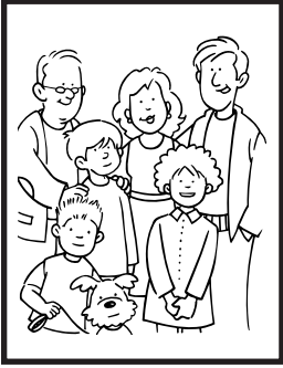
Lesson 7 LG 3