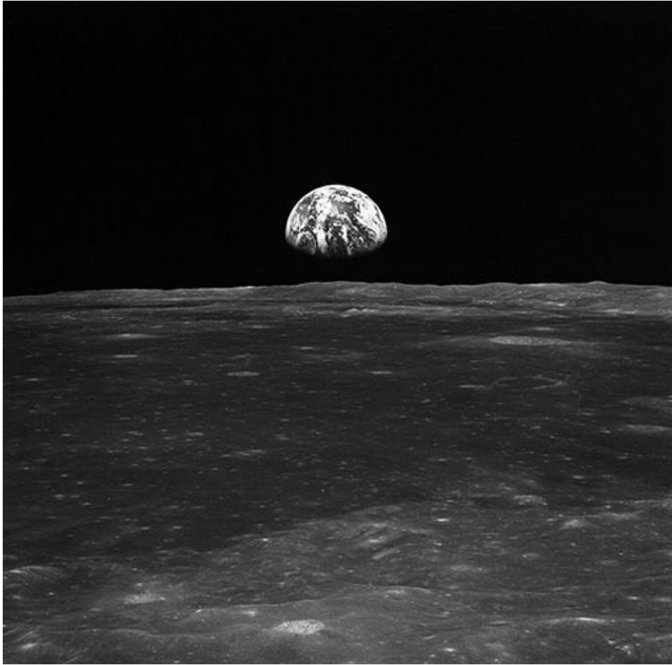
Apollo 11 Earthrise