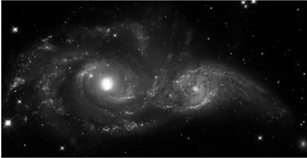
Galaxies NGC 2207 and IC2163