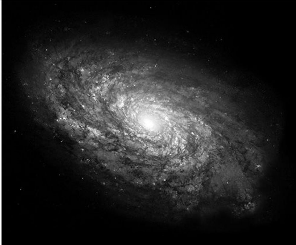
Dusty Spiral Galaxy NGC 4414