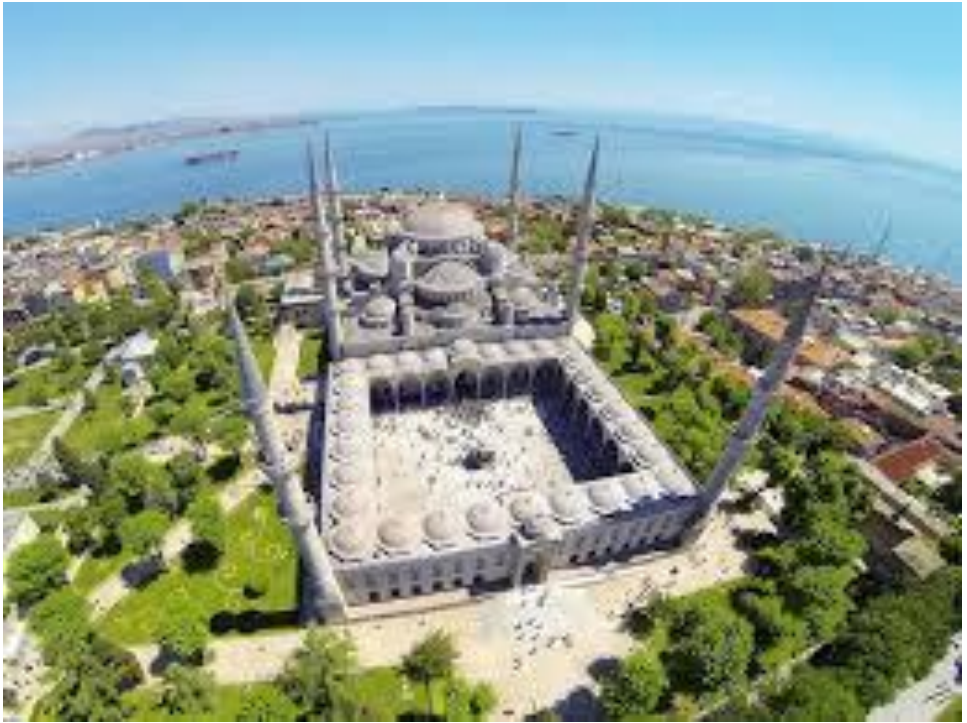
The Masjid Of Sultaan Ahmed (The Blue Mosque)

On the first day of our visit to Istanbul we were directed to the world famous ‘Masjid of Sultan Ahmed’, commonly known amongst Westerners as ‘The Blue Mosque’, due to the beautiful blue colour perceived within when the rays of the sun filter through its blue panes.