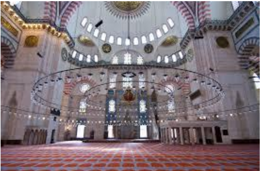
1 Inside The Suleimaniyah Masjid – Note the design of the interior that wherever one sits he enjoys a full view of the Imaam at the front

Sinan's advice was taken, and today, almost 500 years on, the Suleymaniye mosque still stands as a tribute to the great mind and legacy of this proud son of Anatolia. (Worldbulletin.net)