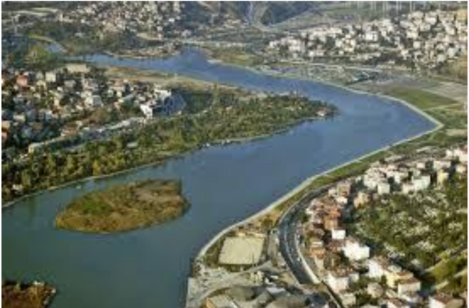
The Golden Horn

Attacking Constantinople by sea was difficult. The strong currents of the Bosphorus endangered hostile fleets without shelter. Meanwhile the Golden Horn served as a perfect harbour for the Byzantines in war and peace. During times of war, it sheltered friendly ships. At the same time it allowed Constantinople to receive supplies by sea to withstand long sieges. Enemy ships were easily blocked from entering the Golden Horn by chains laid out across the waters.