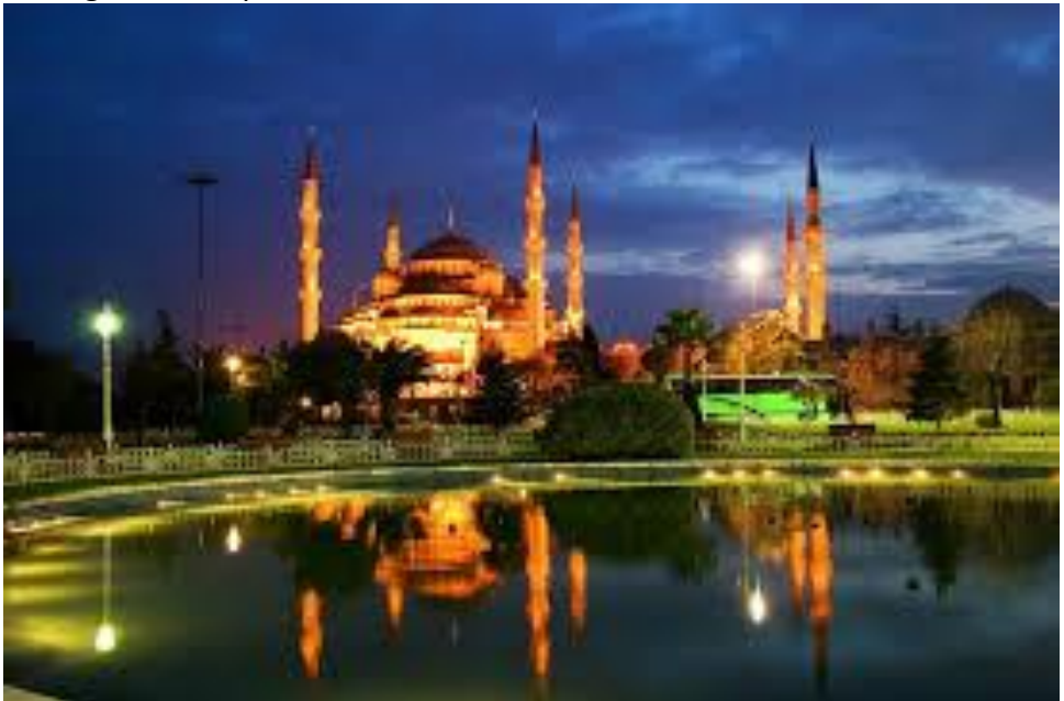
The Masjid of Sultaan Ahmed (at night)

These were just some of the feelings and thoughts that settled in the mind during my first visit to 'The Blue Mosque' (The Masjid of Sultan Ahmed), thoughts that left me feeling that I was indeed in the wake of an Islamic Awakening in Istanbul, one whose ripples shall soon be felt throughout Europe, Insha Allah!