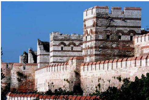
The walls of Constantinople (left)