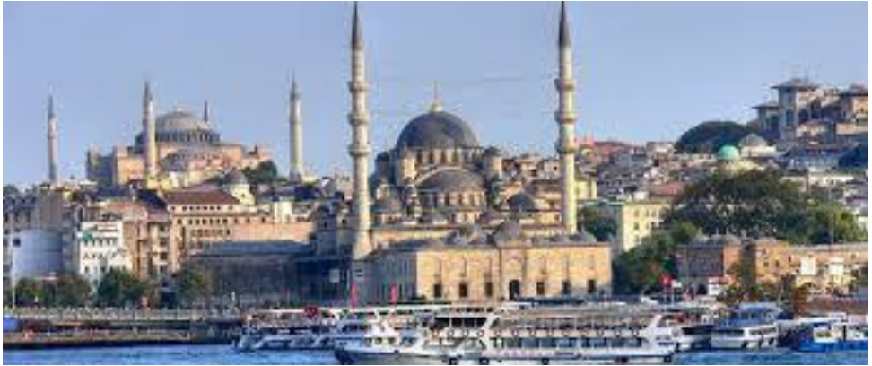
Istanbul -A city beautified with Masaajid

also allowed those who left the city when it was under siege to return home.