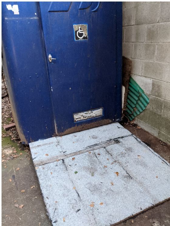
New, sturdy ramp installed by work party volunteer in January.