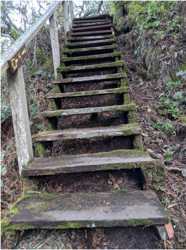
View of full staircase repairs to Target 4