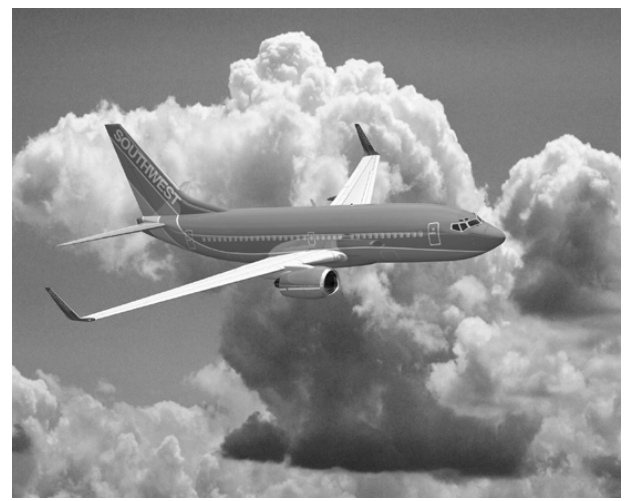
Figure 3 – A Boeing 737-700 jet showing the winglets, which provide increased range and improved climb performance [20].

Wingtip vortices: Flying into the tip vortices of a large transport can cause serious accidents (ex. 1994 crash of USAir flight 427 when it encountered the tip vortices of Delta flight 1083). This problem requires adequate spacing of air transports at busy airports, often causing delays in departures and arrivals. In addition, buildings near busy airports suffer property damage from these vortices (Figure 4). In the Heathrow airport area houses had their roofs damaged by wake vortices, forcing local authorities to spend 5 million pounds to reinforce 2,500 roofs.