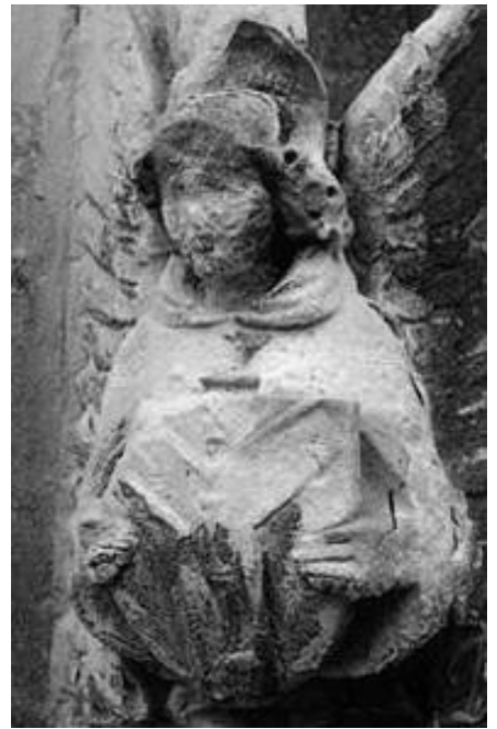
Figure 2 – A popular photograph showing the effects of acid rain on a statue, original source unknown [15].

These issues deal with increase of efficiency and/or the reduction of pollution during power generation.