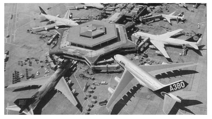
Figure 6 – An Airbus 380 (mock-up) at the gate. Note the relative size of the Boeing 747s [28].

Airplane design to guard against possible terrorist attacks: In light of recent attacks on civilian airplanes with