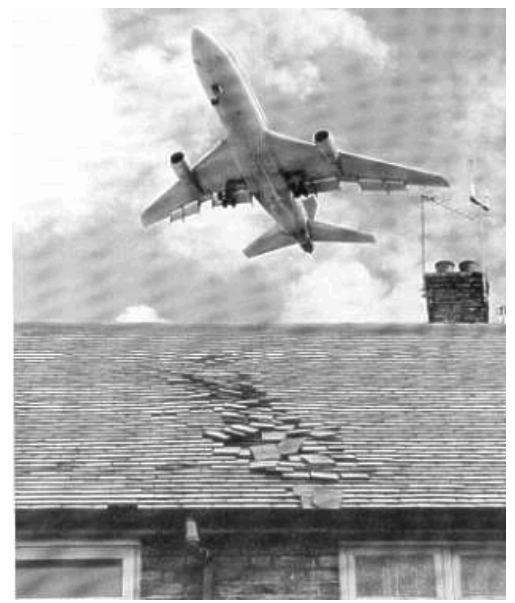
Figure 4 - Roof damage from airplane tip vortices [21].

Compressible flow is a senior-level course, an elective for mechanical engineers and required for aerospace engineers. The following applications are discussed in the lecture and explored further by the students through their research papers: