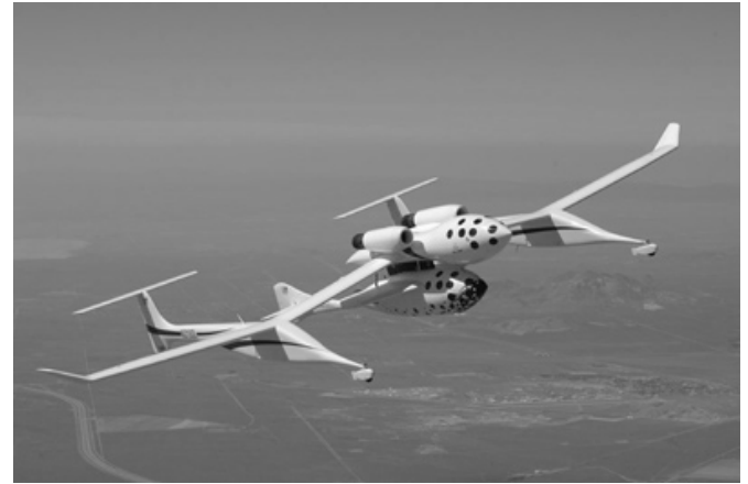
Figure 5 – The White Knight turbojet aircraft with Space Ship One attached to its underbelly. On October 4<sup>th</sup> 2004, it won the $10 million Ansari X Prize. The competition challenged independent designers to safely put three people into space twice in two weeks with a reusable spacecraft [24].

Helicopter noise: Students discover the primary sources of helicopter noise (Figure 6).